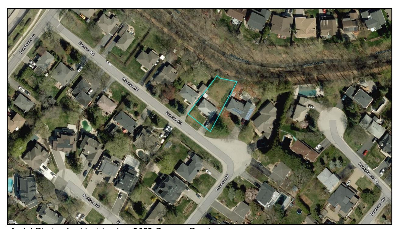
Aerial Photo of subject lands – 2092 Duncan Road

The subject property is located on the east side of Duncan Road, south of Constance Drive and backs onto Joshua Creek. A portion of the property is located within Conservation Halton's regulation limits. The neighbourhood consists of original one-storey, one-and-a-half storey, and two-storey dwellings with both attached and rear detached garages, along with a few newer two-storey dwellings. The existing and proposed dwellings can be viewed in the images below.