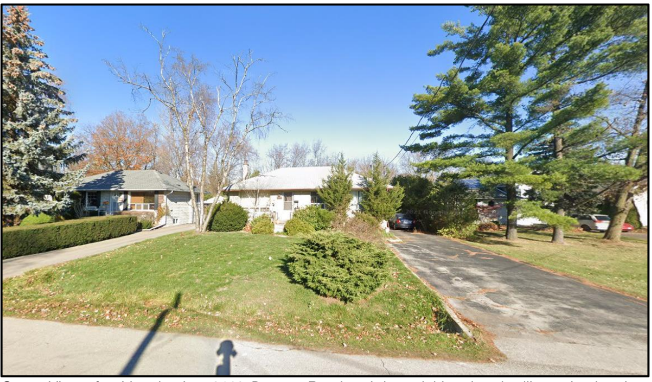
Street View of subject lands - 2092 Duncan Road and the neighbouring dwellings abutting the