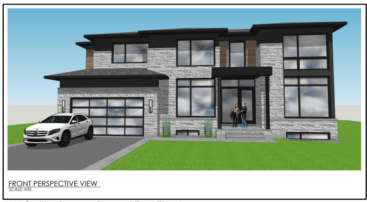
1333 Sheldon Avenue – Proposed Front Elevation