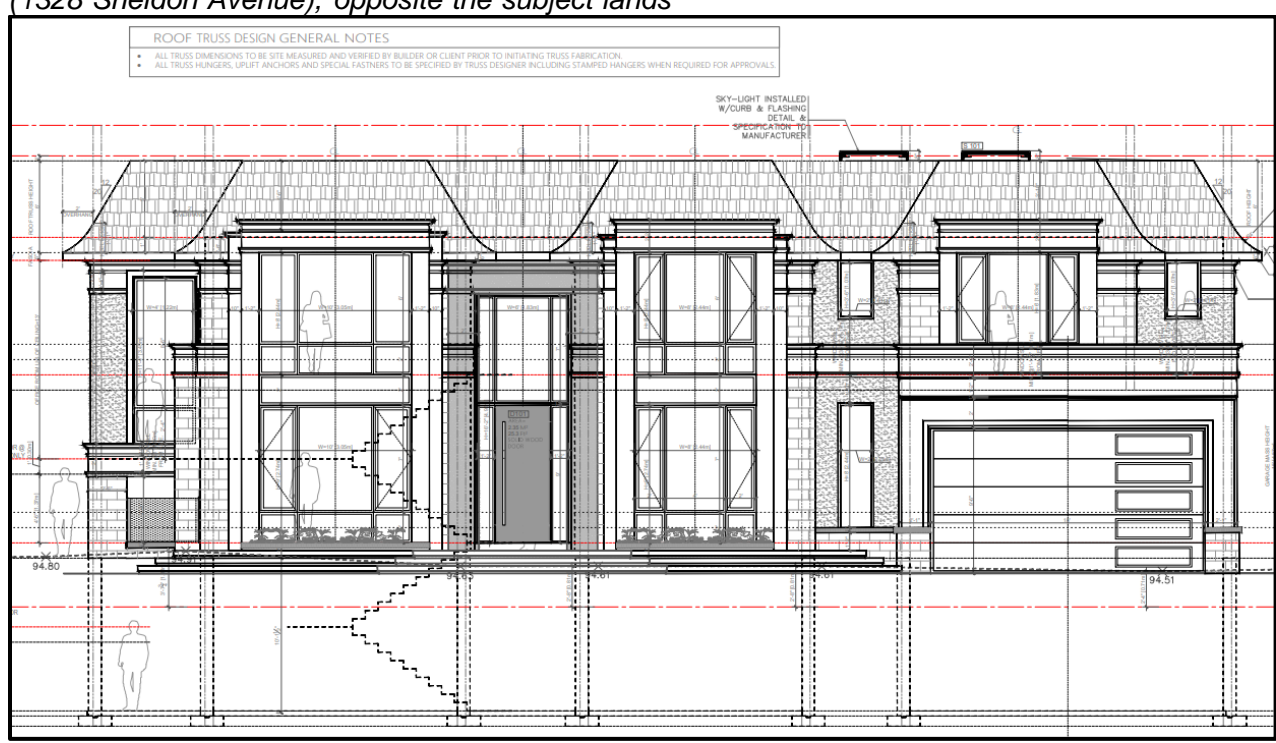
1333 Sheldon Avenue - Proposed Front Elevation

Street View of the one-and-a-half storey dwelling located on the south side of Sheldon Avenue (1328 Sheldon Avenue), opposite the subject lands