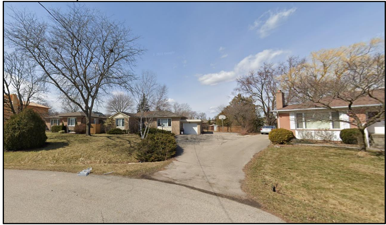
Street View of subject lands – 1333 Sheldon Avenue and the neighbouring dwellings abutting the property to the west at 1337 Sheldon Avenue (left side of photo) and the east at 1331 Sheldon Avenue (right side of photo)

Aerial Photo of subject lands – 1333 Sheldon Avenue