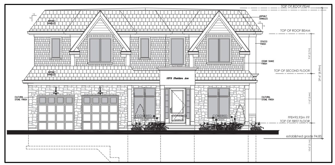
1373 Sheldon Avenue - Front Elevation

On February 7, 2024, Planning staff supported an increase to the residential floor area of a proposed single detached dwelling located at 1373 Sheldon Avenue (CAV A/018/2024) and that variance was granted. The differences between the neighbouring application that was supported by staff and the proposed development for the subject lands can be seen in the table below.