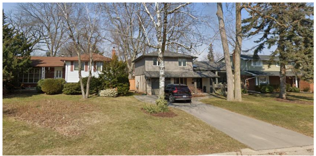
Street View of the original housing stock located on the north side of Ulster Drive