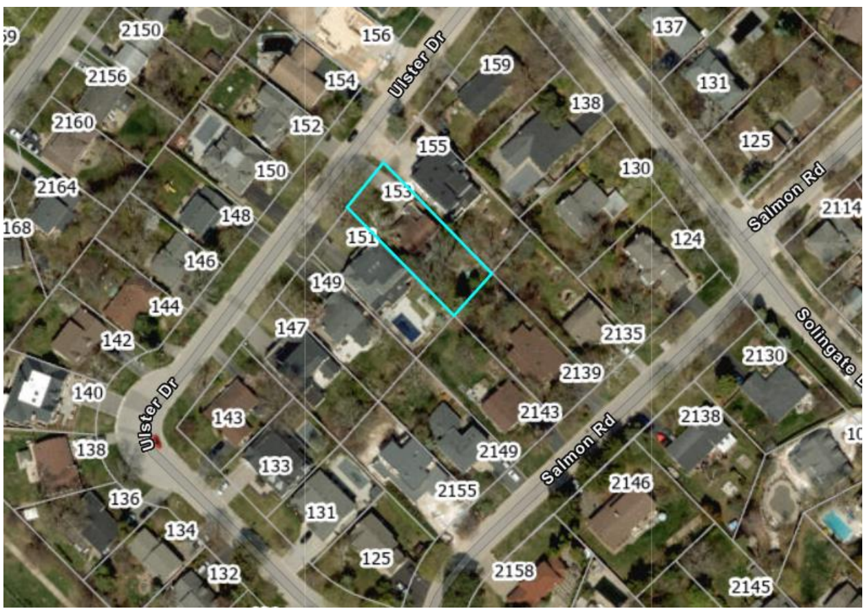
Aerial Photo of subject lands - 153 Ulster Drive

The subject property is located on the south side of Ulster Drive, west of Solingate Drive and north of Salmon Road. The neighbourhood consists of original one-storey, and two-storey dwellings, along with a newer two-storey dwellings. The existing and proposed dwellings can be viewed in the images below.