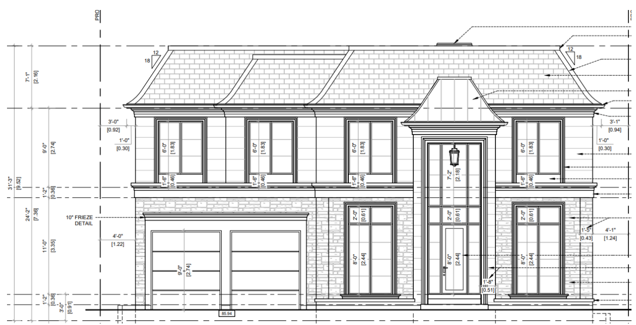
153 Ulster Drive – Proposed Front Elevation