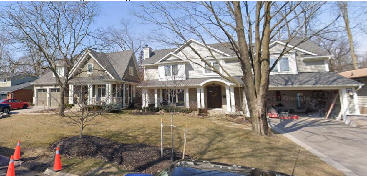
Street view of newer two-storey dwellings located on Ulster Drive