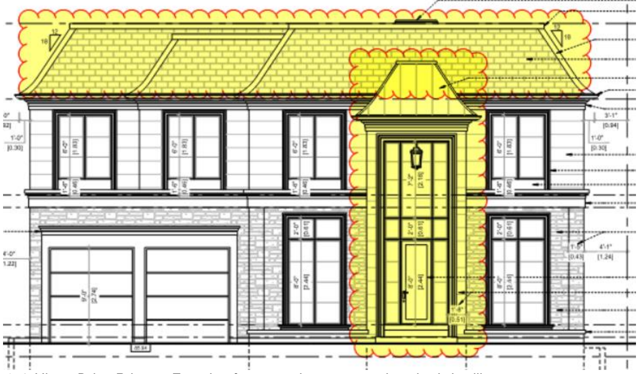
153 Ulster Drive Primary Façade of proposed two-storey detached dwelling

integrated into the second storey to help mitigate massing and scale from the public realm. In addition, the inclusion of the two-storey front porch creates an overpowering front façade element which also projects massing towards the public realm. The lack of other mitigation measures such as; the second storey not being stepped back from the front main wall of the first storey, façade articulation, variation in roof forms, and massing that is broken up into smaller elements, exacerbates the negative impacts of mass and scale on the surrounding properties and the streetscape. The proposed dwelling will result in massing and scale impacts, visible from the public realm, and would not be in keeping with the established neighbourhood character.