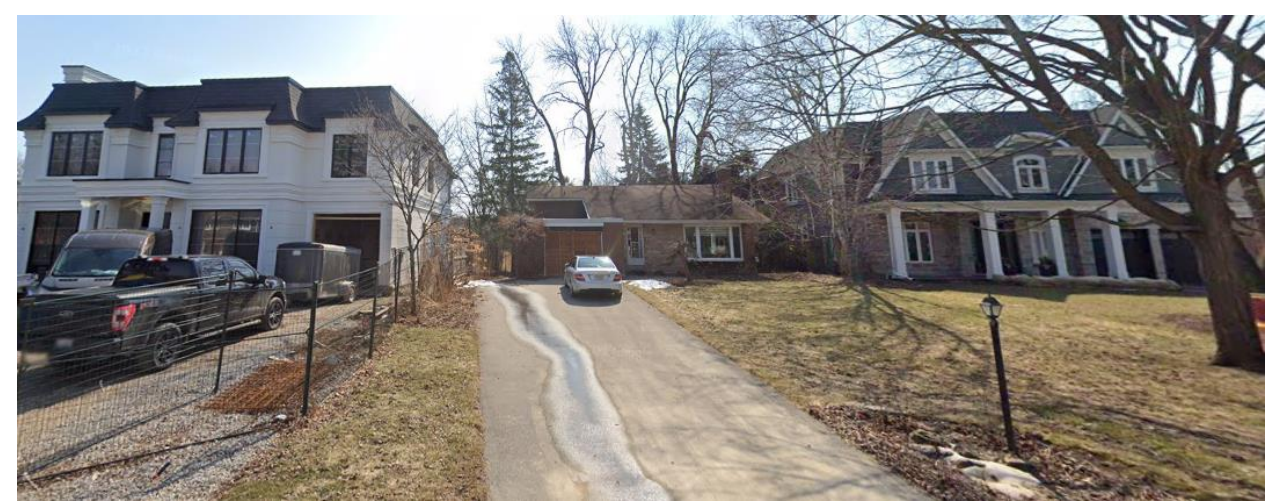
Street View of subject lands - 153 Ulster Road with adjacent, newer two-storey dwellings