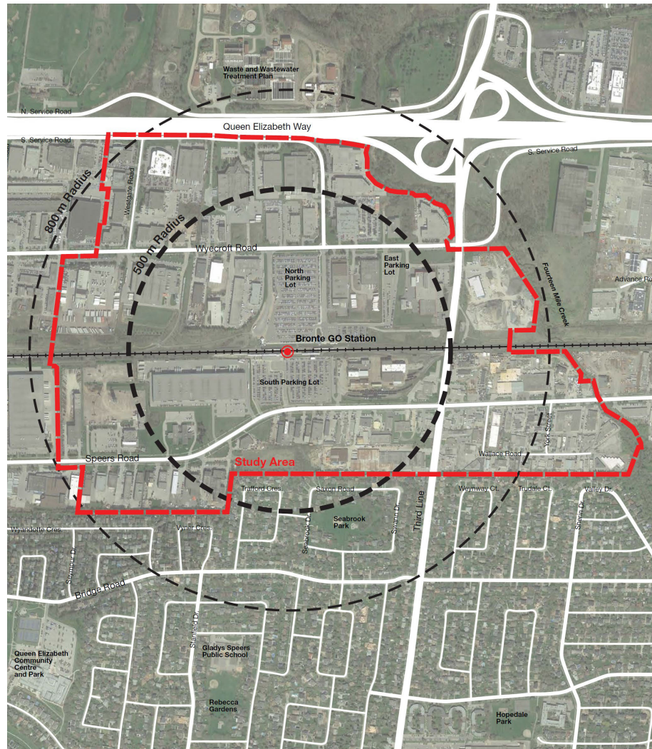
Figure 2. Draft Study Area Boundary

A Draft Study Area has been delineated through the process to date, as follows: