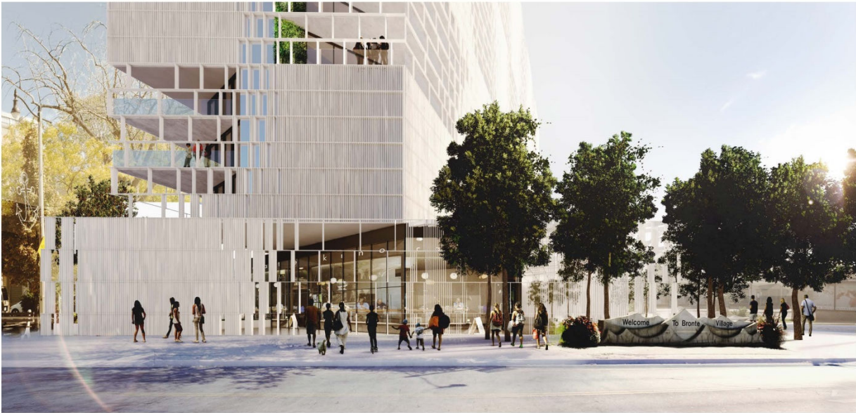
Rendering – Urban Square