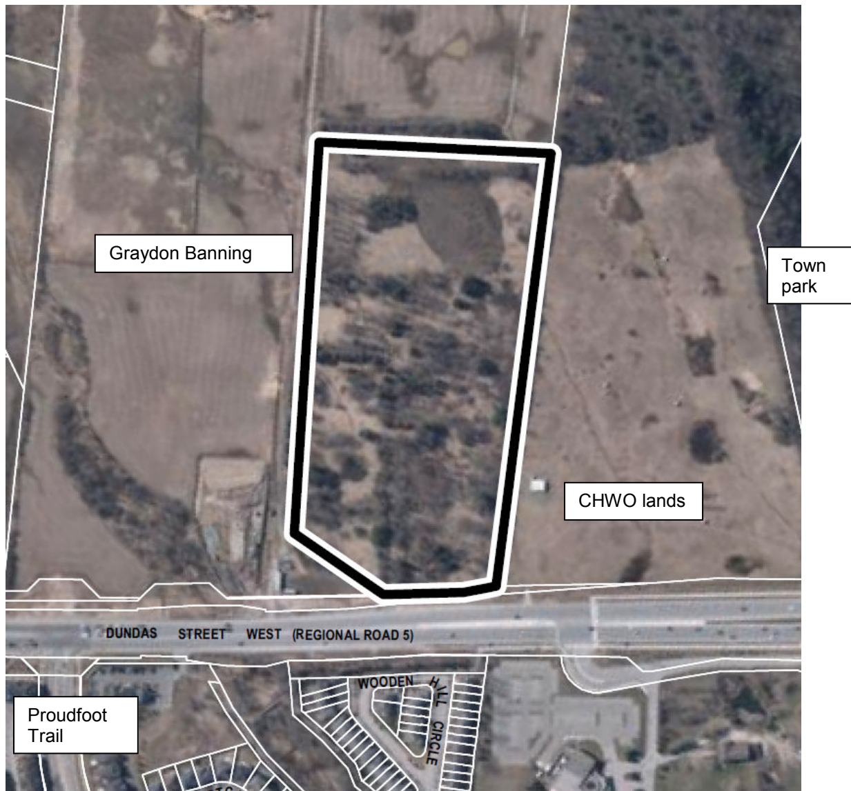
Figure 1 – Location

The vacant subject lands, being 6.54 hectares in size, are located east of the intersection of Proudfoot Trail and Dundas Street West. The legal description of the lands is Part of Lot 24, Concession 1, N.D.S.