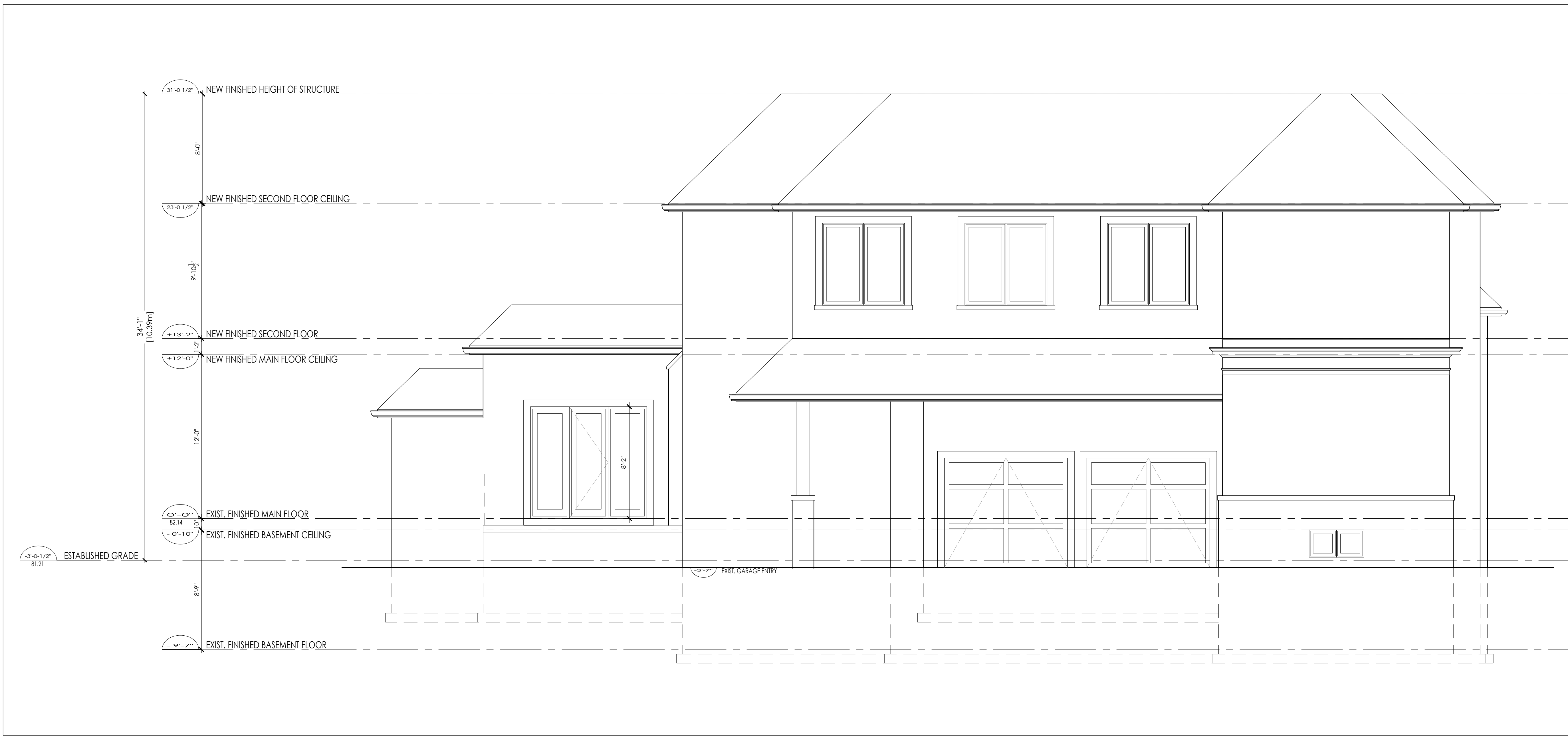
SOUTH ELEVATION 1 SCALE: 1/4" = 1'-0" A3.1

The Architect is not responsible for the accuracy of survey, structural, mechanical, electrical, etc., engineering information shown on the drawing. Refer to the appropriate engineering drawings before proceeding with work. Contractor shall check all dimensions on the work and report any discrepancy to the Architect before proceeding. Construction must conform to all applicable Codes and Requirements of Authorities having Jurisdiction. All drawings, specifications and related documents are the copyright property of the Architect and must be returned upon request. Reproduction of drawings, specifications and related documents in part or whole is forbidden without the Architect's permission. This drawing is not to be scaled.