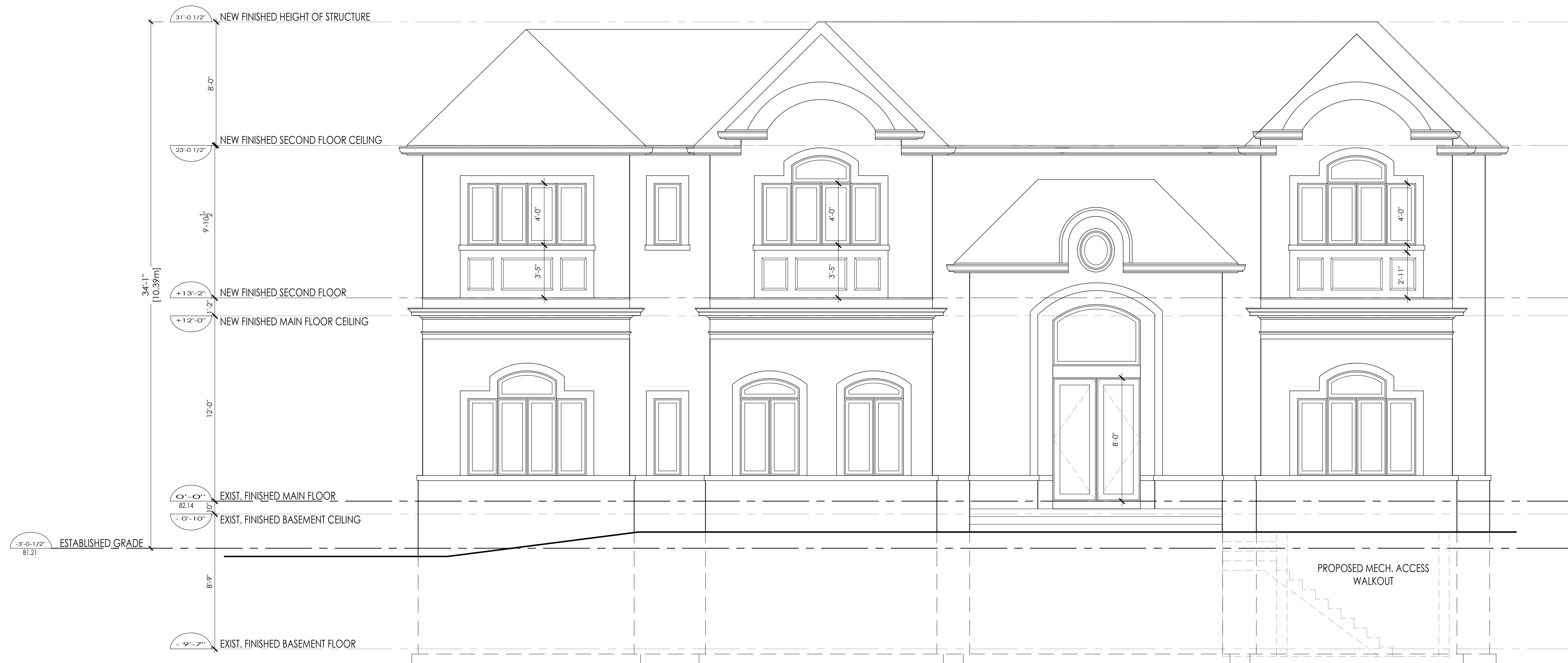
FRONT ELEVATION 1 SCALE: 1/4" = 1'-0" A3.0

The Architect is not responsible for the accuracy of survey, structural, mechanical, electrical, etc. engineering information shown on the drawing. Refer to the appropriate engineering drawings before proceeding with work. Contractor shall check all dimensions on the work and report any discrepancy to the Architect before proceeding. Construction must conform to all applicable Codes and Requirements of Authorities having Jurisdiction. All drawings, specifications and related documents are the copyright property of the Architect and must be returned upon request. Reproduction of drawings, specifications and related documents in part or whole is forbidden without the Architect's permission. This drawing is not to be scaled.