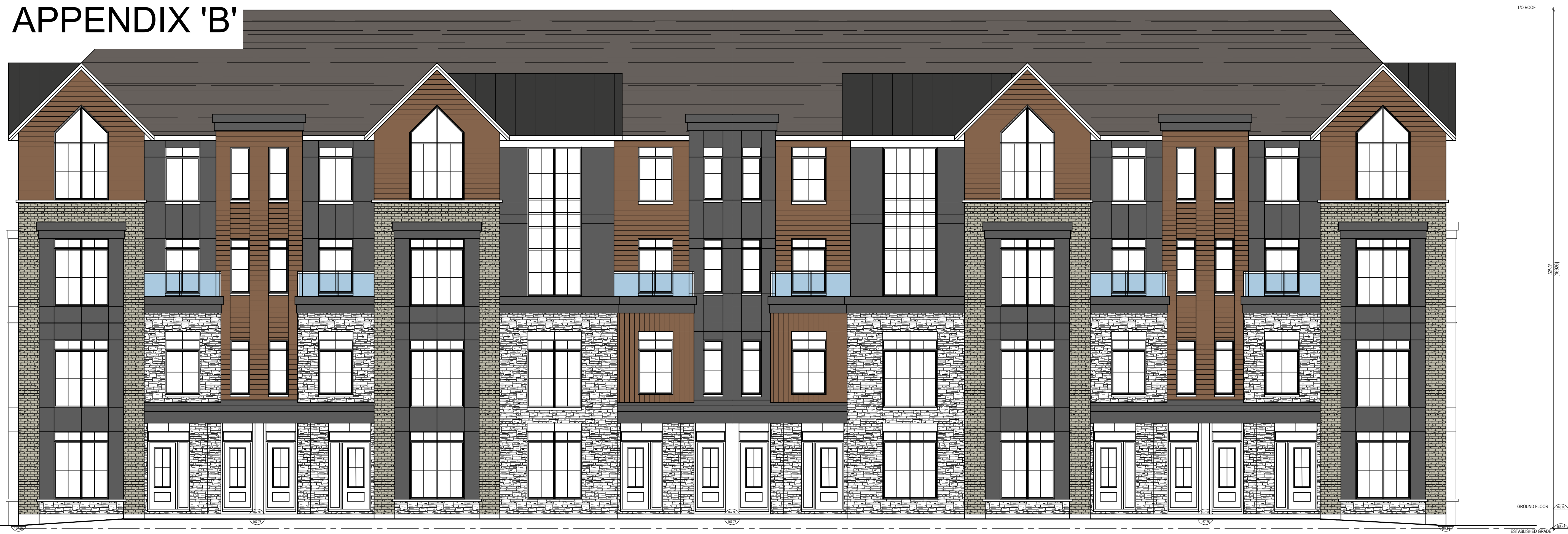
2 SOUTH ELEVATION SCALE: 3/16"=1'-0"