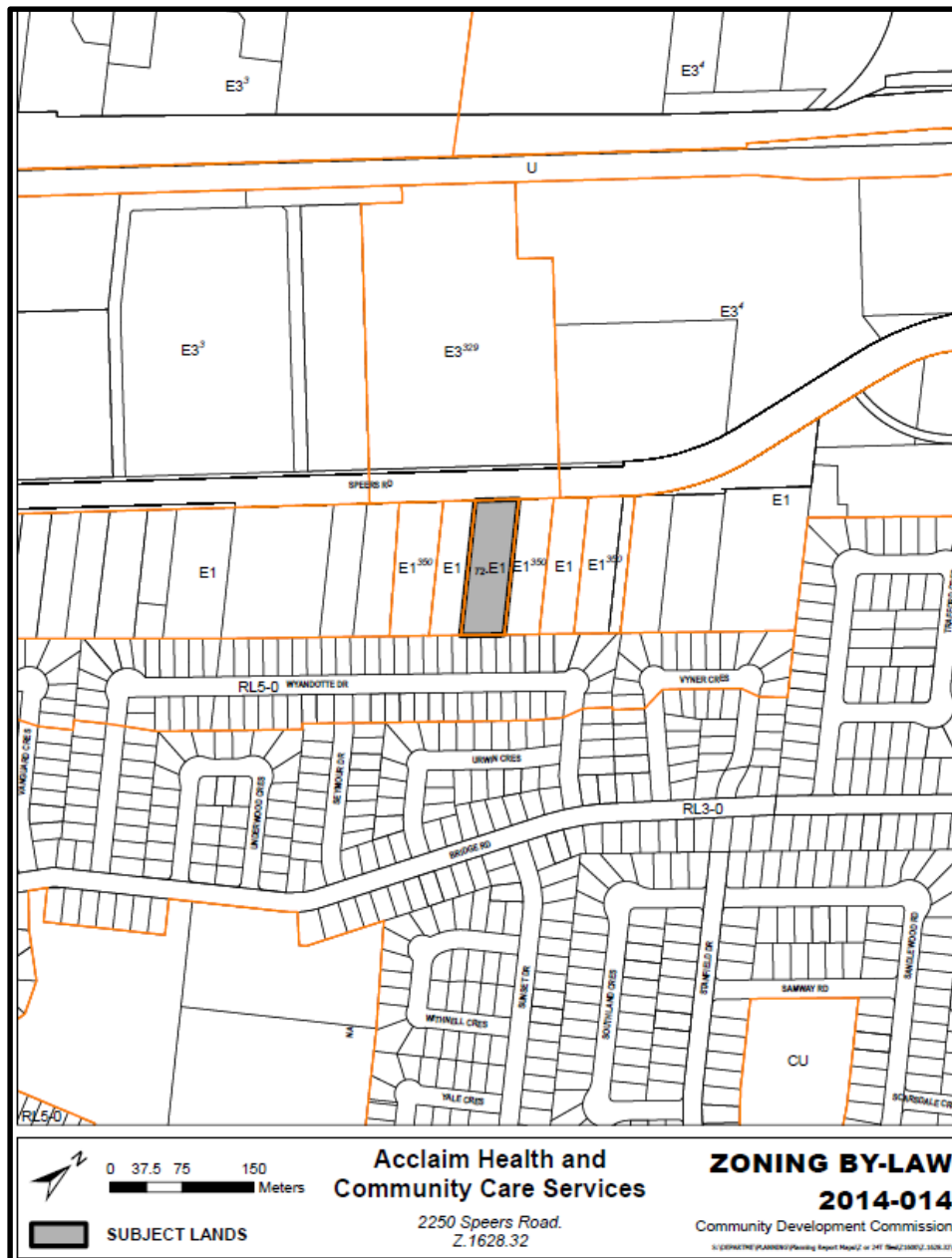
Figure 3: 2014-014 Zoning Excerpt Map