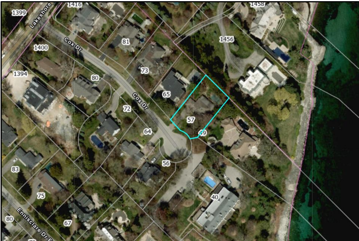
Figure 1 - Aerial Photo