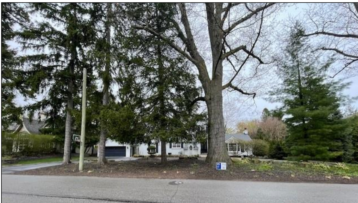
Figure 2 - 317 Gloucester Avenue – Existing Dwelling