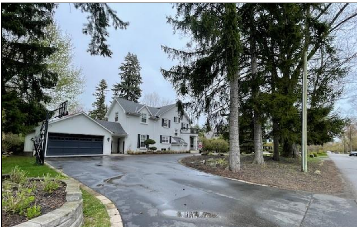
Figure 3 - 317 Gloucester Avenue – Existing Northerly Driveway