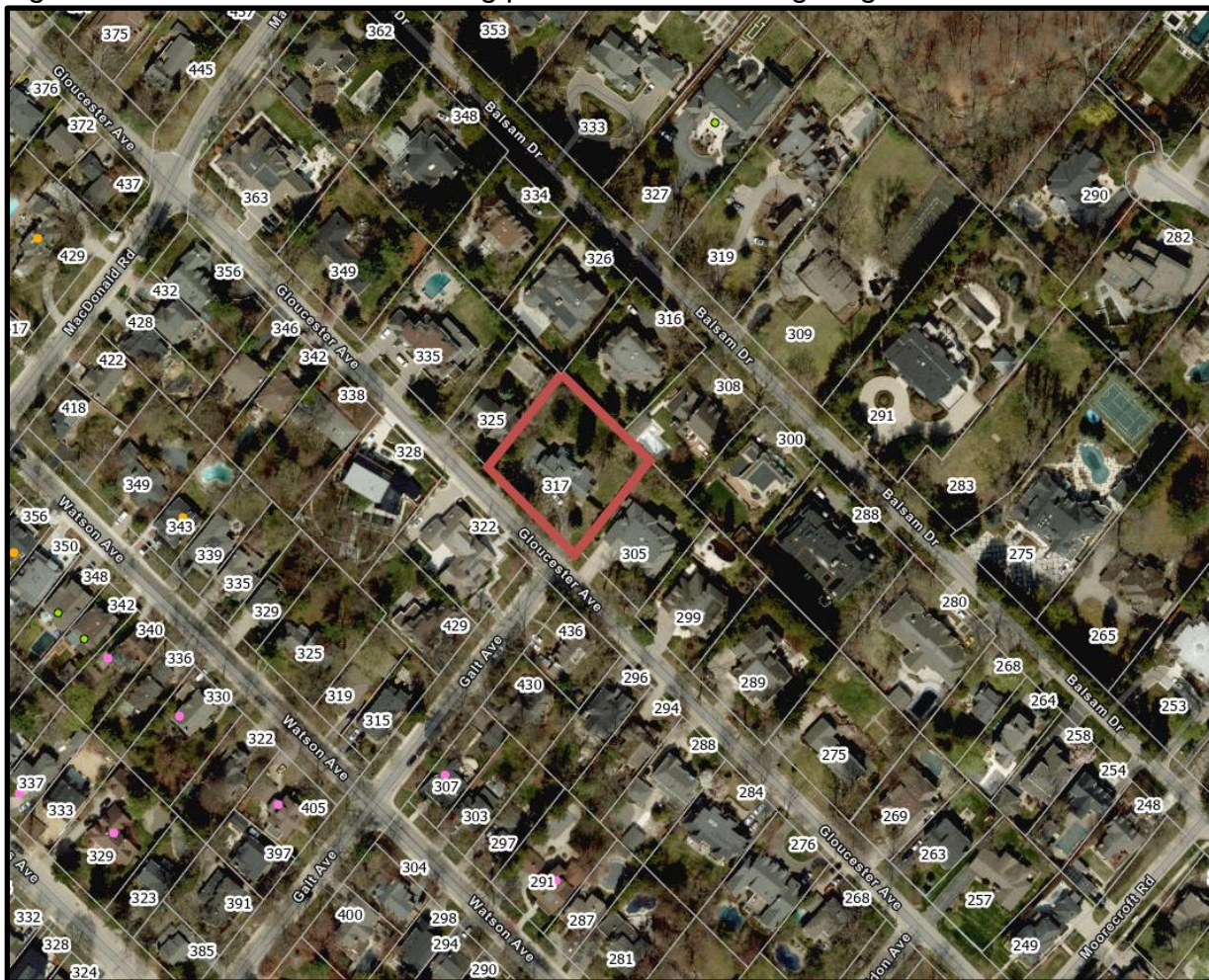
Figure 1 - Aerial Photo of 317 Gloucester Avenue

Figure 1 below illustrates the lotting pattern of the existing neighbourhood.