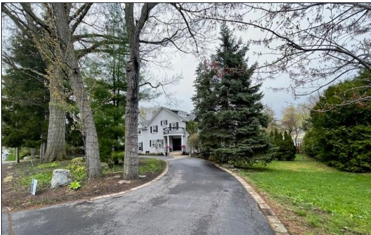
Figure 4 - 317 Gloucester Avenue – Existing Southerly Driveway

The following image is an excerpt from the plan showing the proposed severance, as prepared by a surveyor. The image depicts the presence of a mature town tree and several mature trees along the northerly property line of the existing lot that would need to be removed in order to accommodate the proposed driveway and detached garage in the rear.