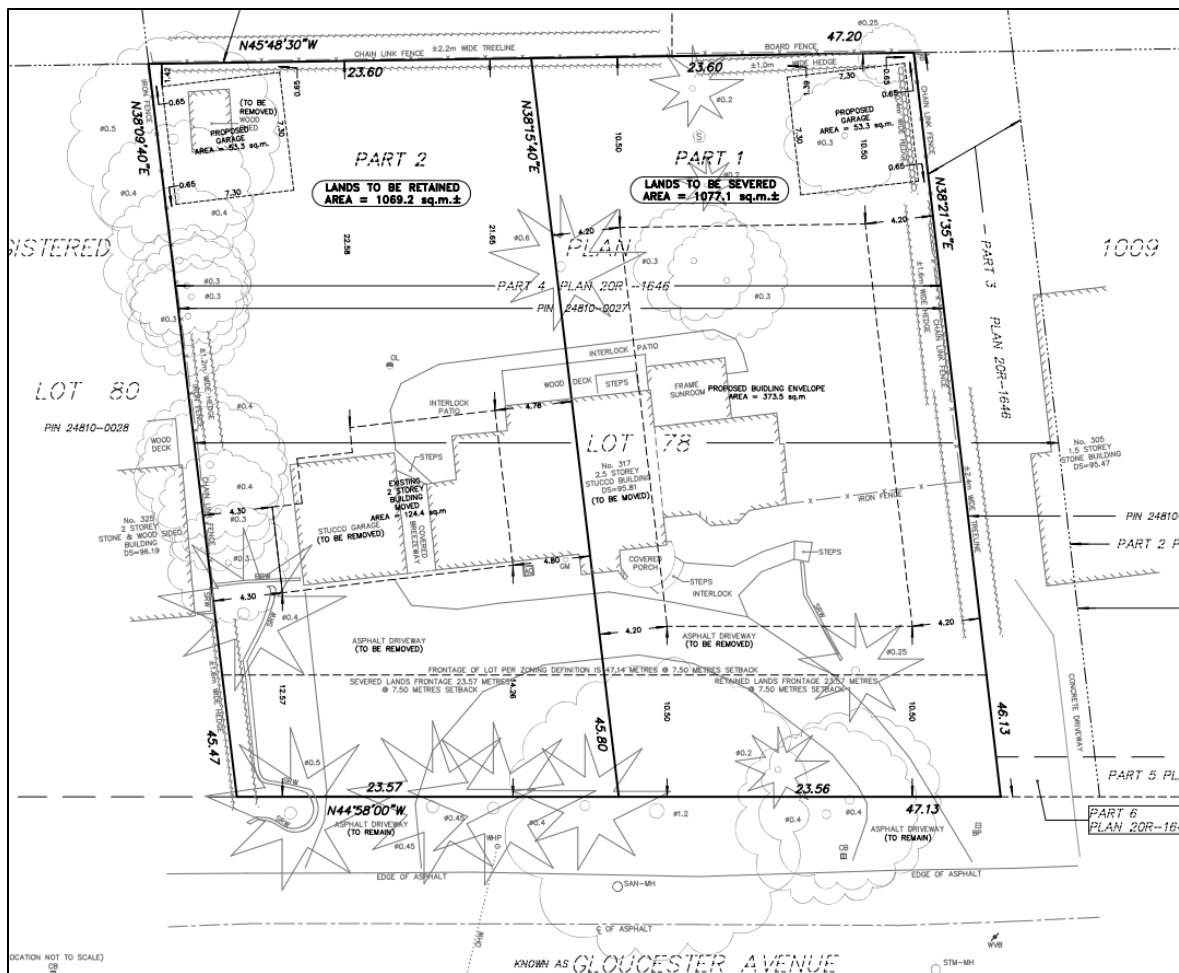
Figure 5 - Plan Showing Proposed Severance, MacKay and MacKay & Peters Ltd. (O.L.S.), dated February 26, 2025