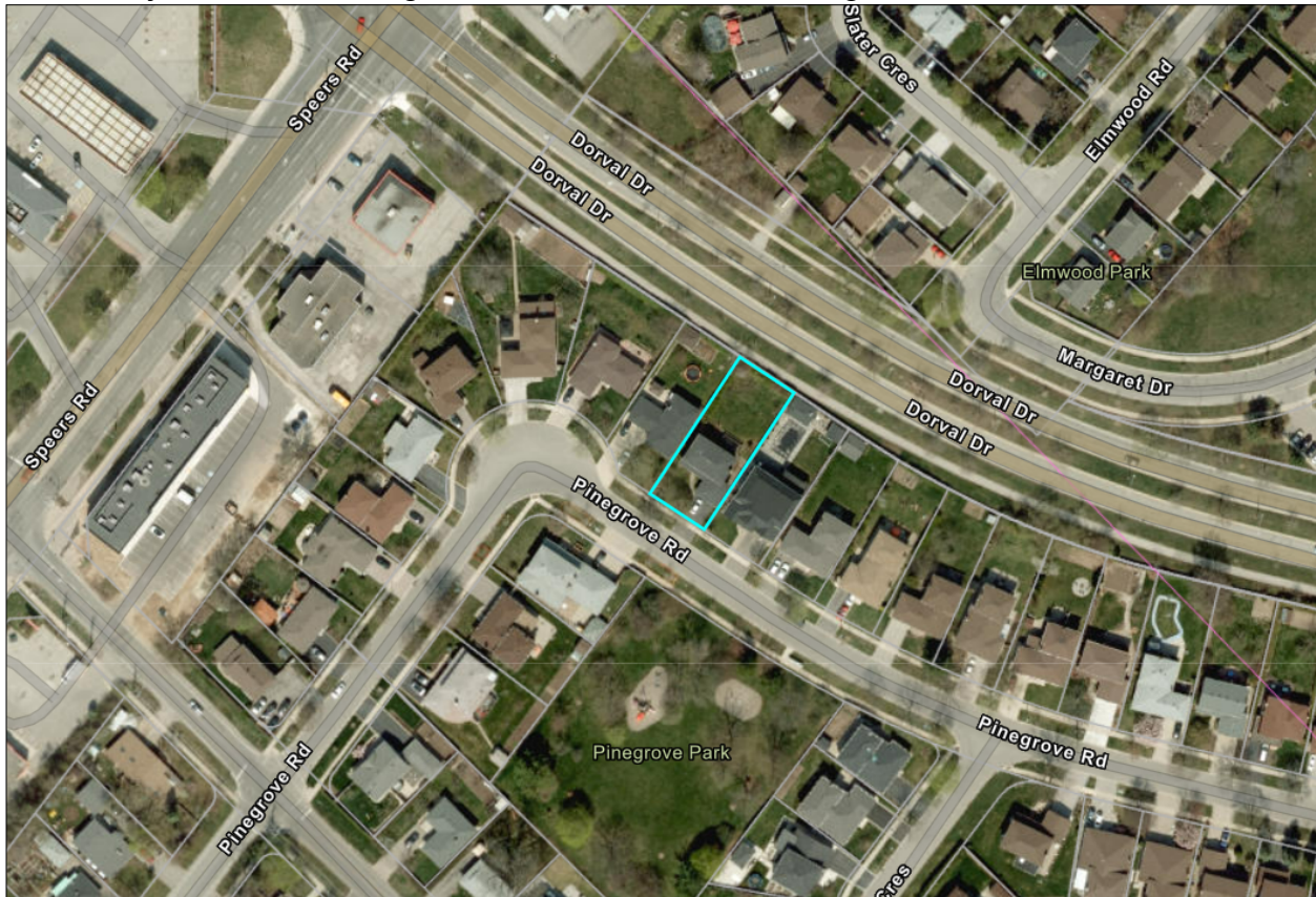
Aerial Imagery - 339 Pinegrove Road

The subject lands are located near the curve in Pinegrove Road, within a neighbourhood that is characterized as having a mix of one- and two-storey dwellings with many homes original to the subdivision. Opposite the subject property, directly west of the subject lands is Pinegrove Park, as shown in the figure below