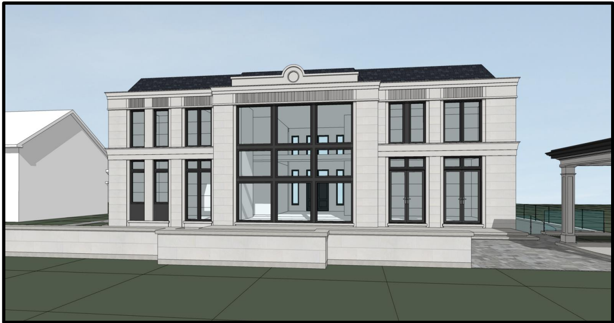
1547 Bayview Road – Proposed Rear Elevation

In Staff's opinion, the proposed floor area and lot coverage increases, large open-to-below areas at the front and rear of the dwelling, along with some of the chosen exterior façade design elements, have not been properly considered when examining it against the existing character of the stable residential neighbourhood in which it is located. As such, the proposal results in a development that appears to be substantially larger than those around it and would result in negative cumulative impacts on the surrounding neighbourhood. On this basis, it is Staff's opinion that variances #1, #2, and #3 do not maintain the general intent and purpose of the Official Plan as these variances contribute to a proposal that would not maintain nor protect the character of the existing neighbourhood.