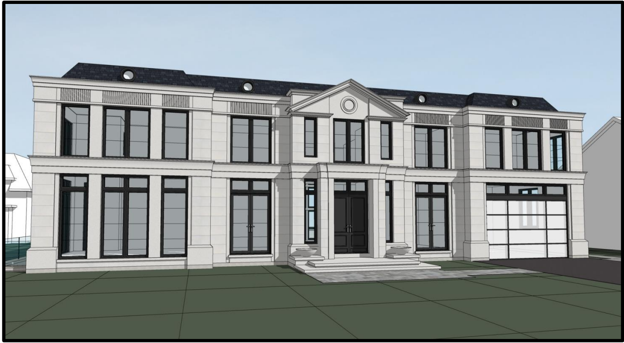
1547 Bayview Road – Proposed Front Elevation