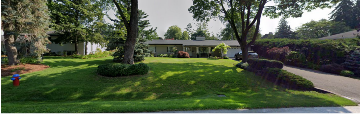
Streetview – 137 Dornie Road

The applicant is seeking relief from the Zoning by-law 2014-014, as amended, as follows: