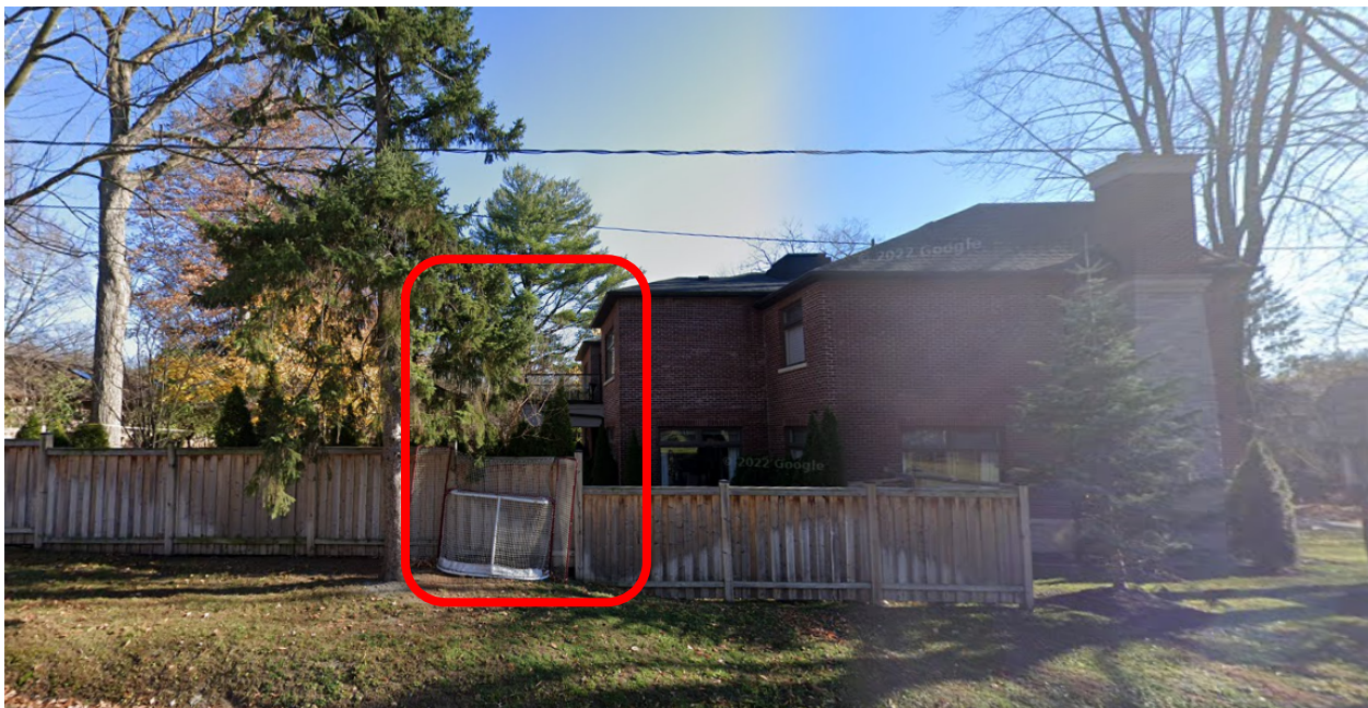
Streetview – 401 Ash Road