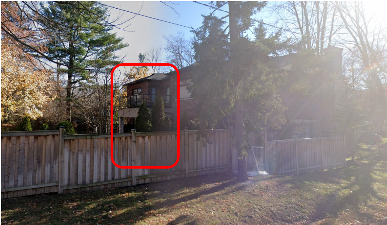
Streetview – 401 Ash Road

Variance #1 – Maximum Residential Floor Area Ratio (Objection) – 37% increased to 41.91%