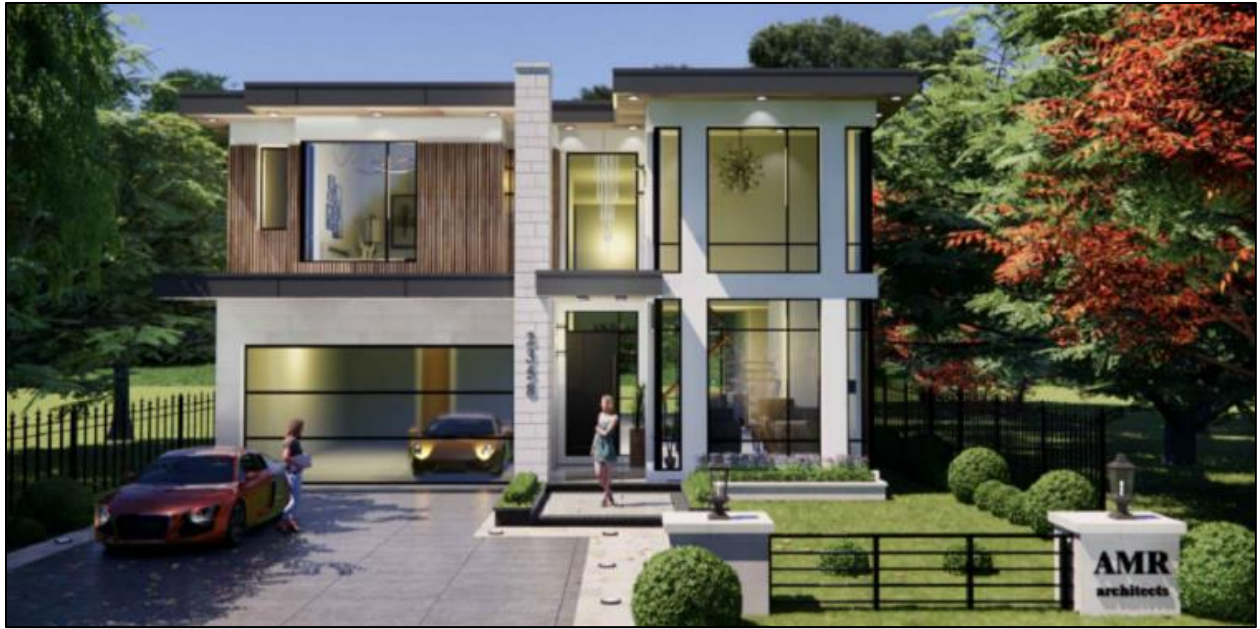
Excerpt of 3D View – 2358 Rebecca Street