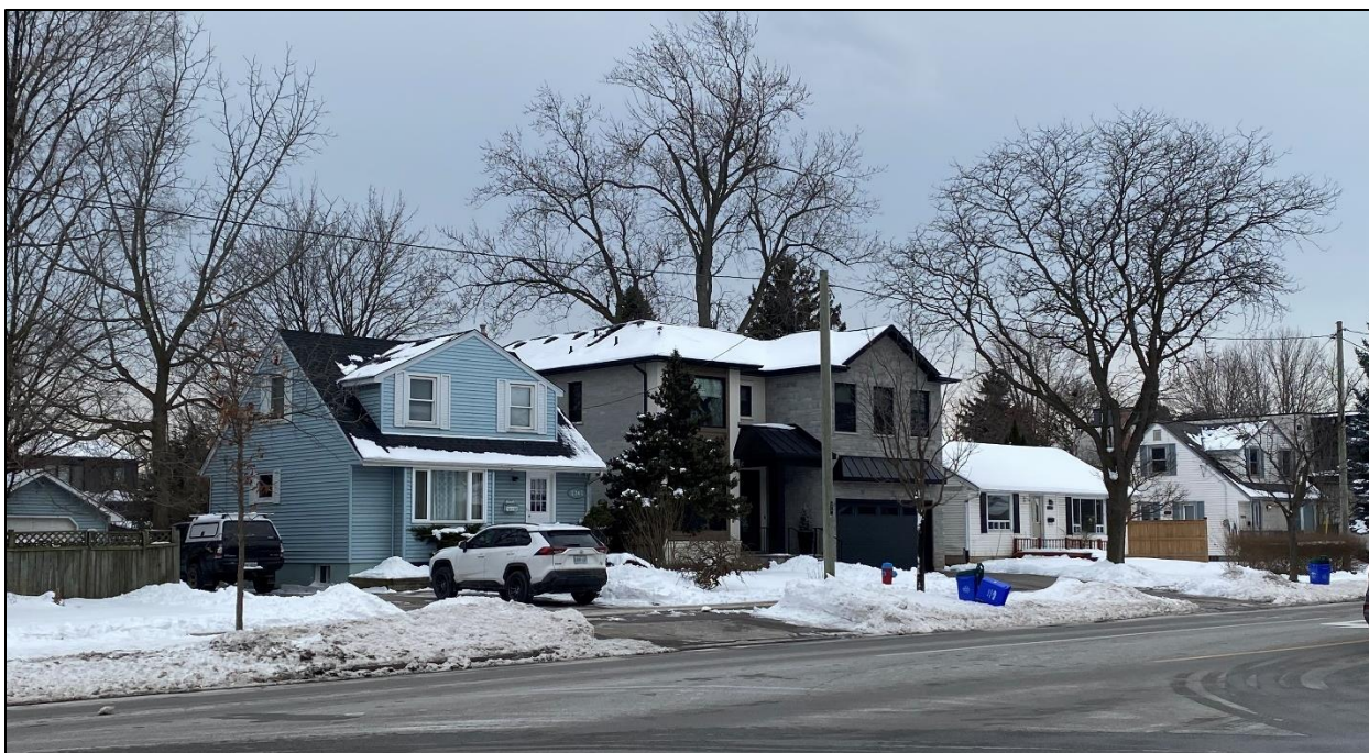
Lands to the West – 2362, 2366 and 2370 Rebecca Street

The following images illustrate the existing dwelling and proposed dwelling at 2358 Rebecca Street.