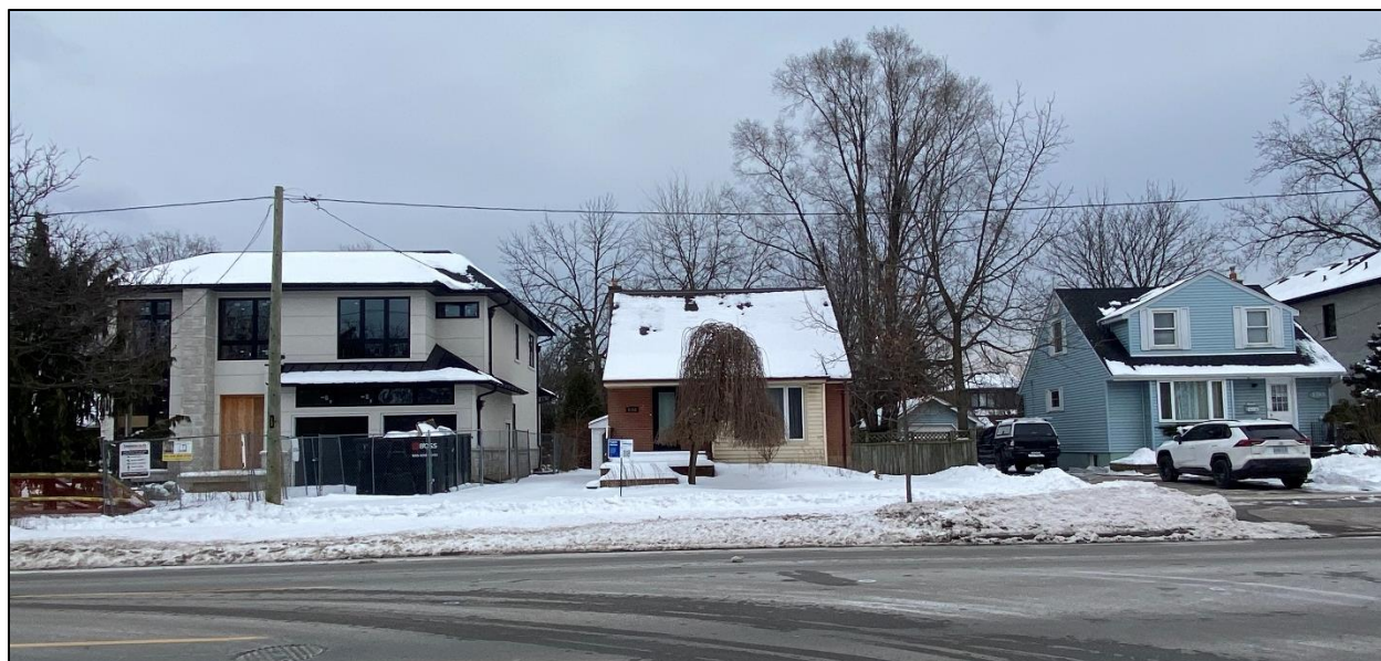
Subject lands – 2358 Rebecca Street

The following images illustrate the existing dwelling and proposed dwelling at 2358 Rebecca Street.