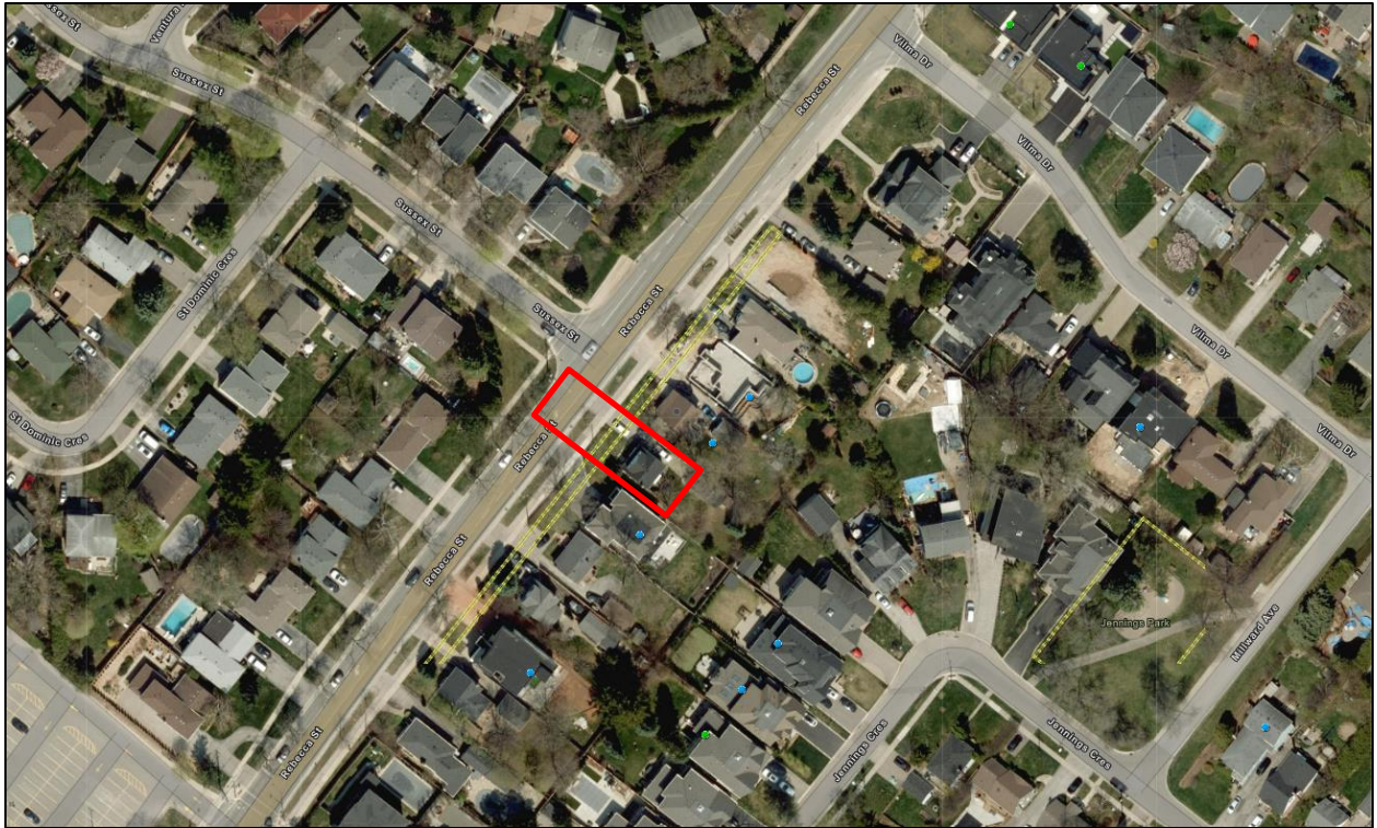
Aerial Photo – 2358 Rebecca Street

The following images are of adjacent dwellings and other dwellings along Rebecca Street.