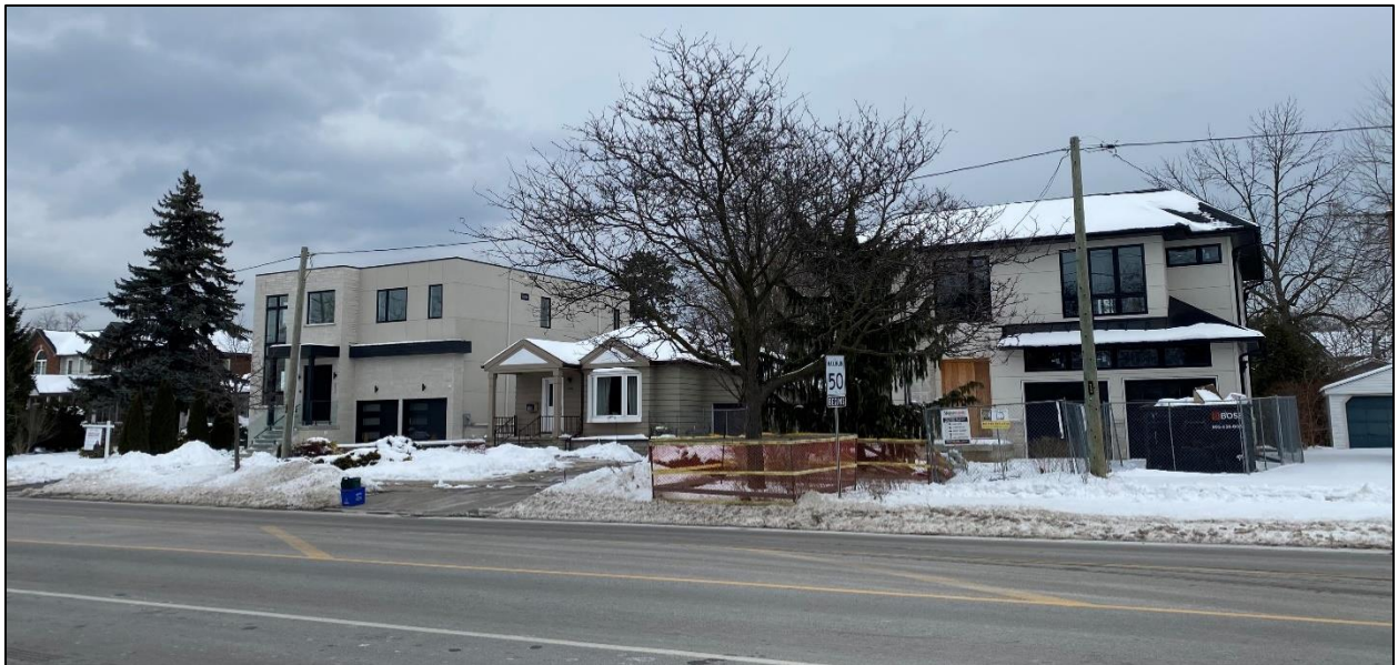
Lands to the East – 2346, 2350 and 2354 Rebecca Street

The following images are of adjacent dwellings and other dwellings along Rebecca Street.