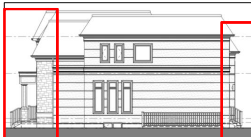
Proposed Right (South) Elevation –November 13/24