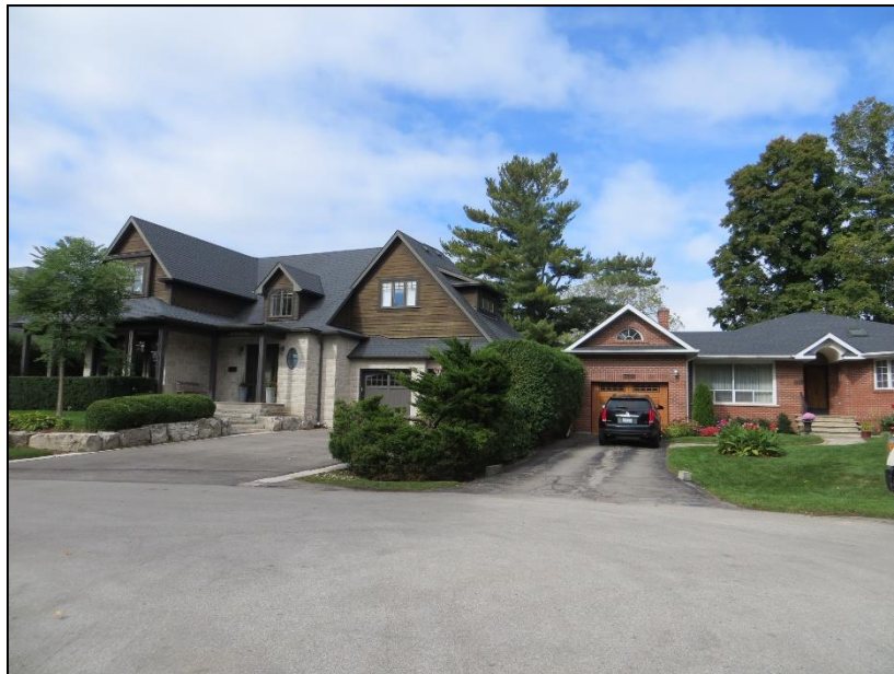
1189 Wood Place (left) & 1183 Wood Place (right) – Photo taken October 2024