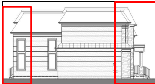
Proposed Left (North) Elevation –November 13/24