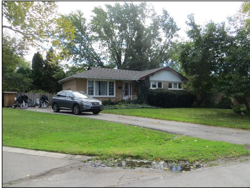
1186 Wood Place – Photo taken October 2024