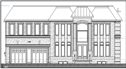
Proposed Front (West) Elevation –May 14/24