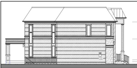
Proposed Left (North) Elevation –May 14/24