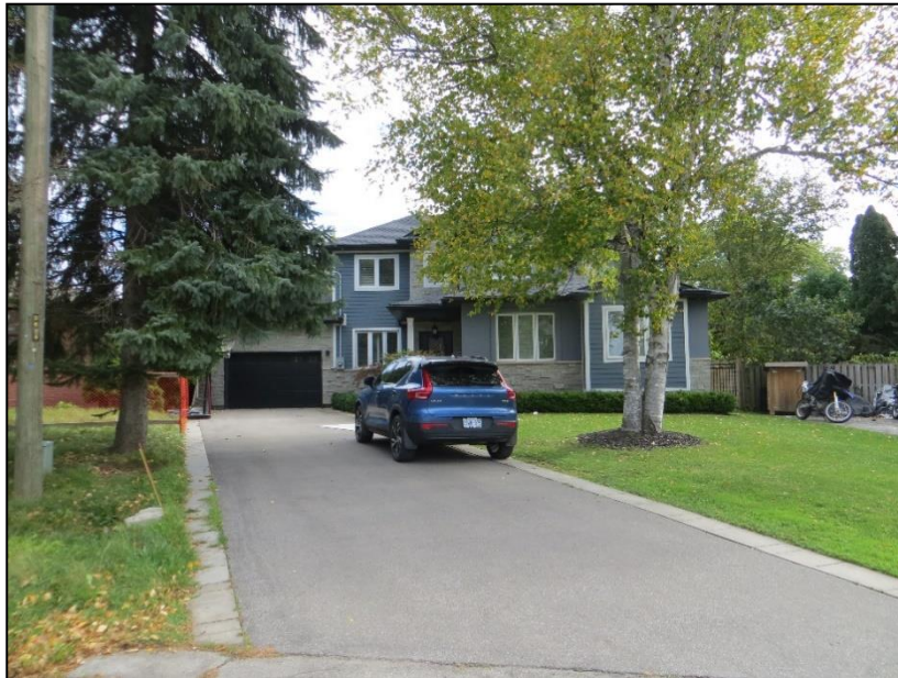
1182 Wood Place – Photo taken October 2024