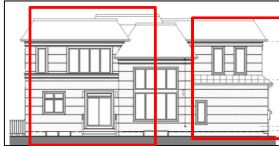
Proposed Rear (East) Elevation –November 13/24