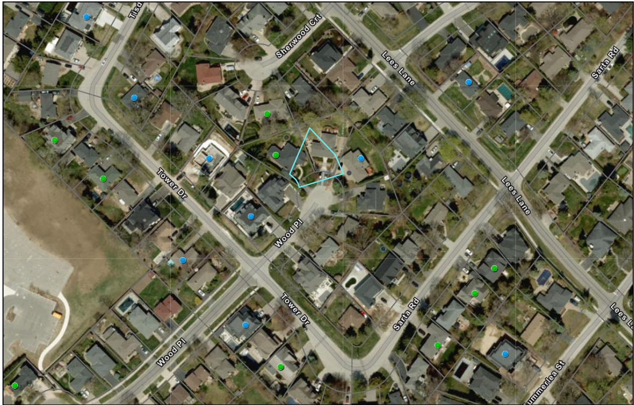
Aerial Photo – 1178 Wood Place

The subject lands are located at the end of a cul-de-sac within a neighbourhood that consists of one- and two-storey dwellings with some newer two-storey dwellings having been constructed in recent years.