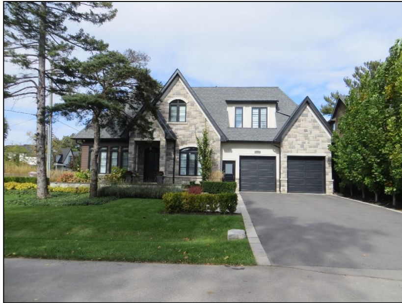
1195 Wood Place – Photo taken October 2024

The existing dwelling and proposed dwelling for the subject lands may be viewed in the images below.