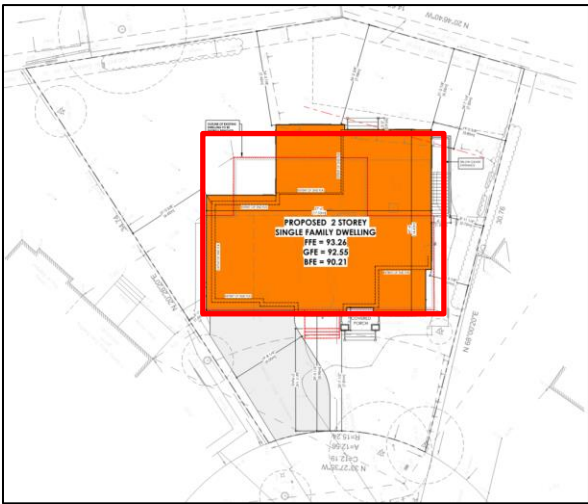
Proposed Site Plan – dated November 13/24

The excerpts of the elevation drawings, below, provide a comparison of the changes that have been proposed to address concerns around massing of the dwelling.