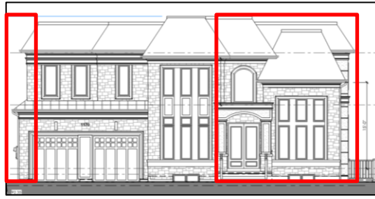
Proposed Front (West) Elevation –November 13/24