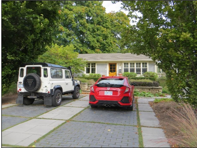
1177 Wood Place – Photo taken October 2024

The following images are of adjacent dwellings and recently constructed dwellings along Wood Place.