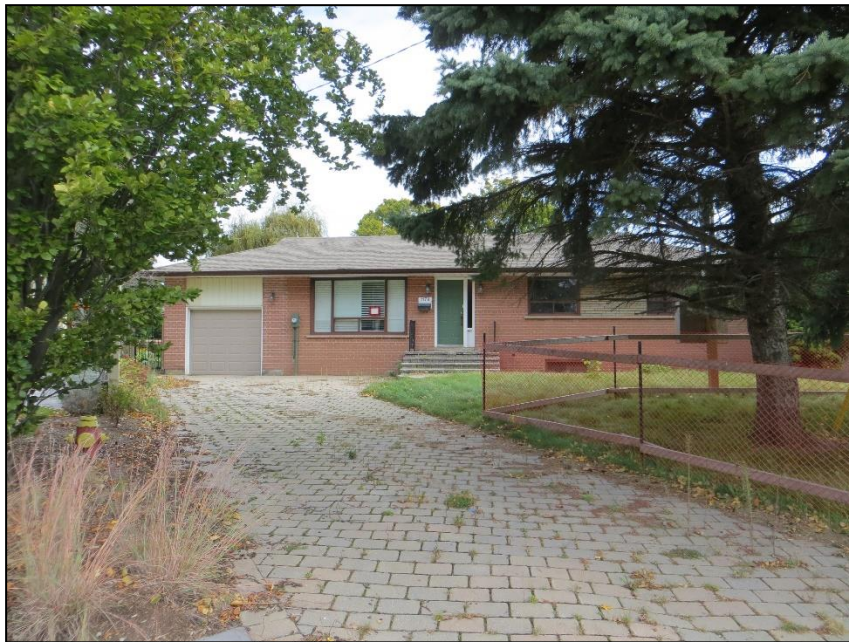
Existing Dwelling – 1178 Wood Place – Photo taken October 2024

The existing dwelling and proposed dwelling for the subject lands may be viewed in the images below.