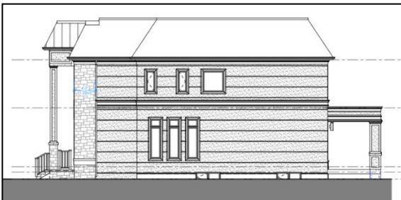
Proposed Right (South) Elevation –May 14/24