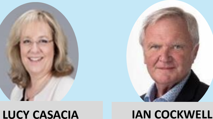
Smart Cities & Private Equity Investor, Infrastructure Leader Real Estate Development Investment, & Governance