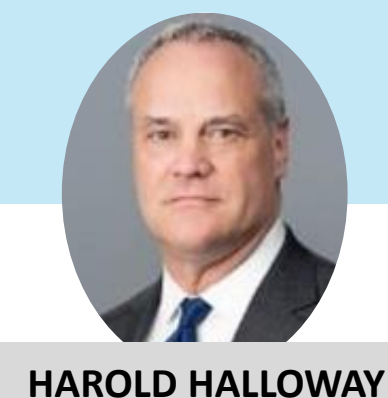
Energy Sector Finance & Investment Advisor