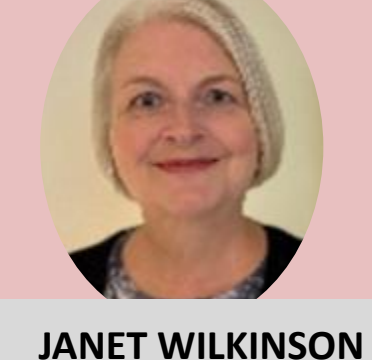
Human Resources, Labour Relations & Governance