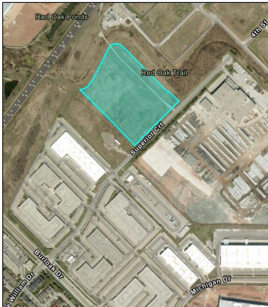
Figure 2 – Aerial view of 3303 – 3323 Superior Court

The land uses surrounding the subject property are comprised of other industrial uses and buildings containing office space, as well as warehousing. Located directly to the north and west of the property is a Town-owned creek block that contributes to the Town's Natural Heritage System inventory and is within Conservation Halton's regulatory limits. Figure 2 below shows an aerial view of the subject lands (highlighted in teal) and surrounding uses.