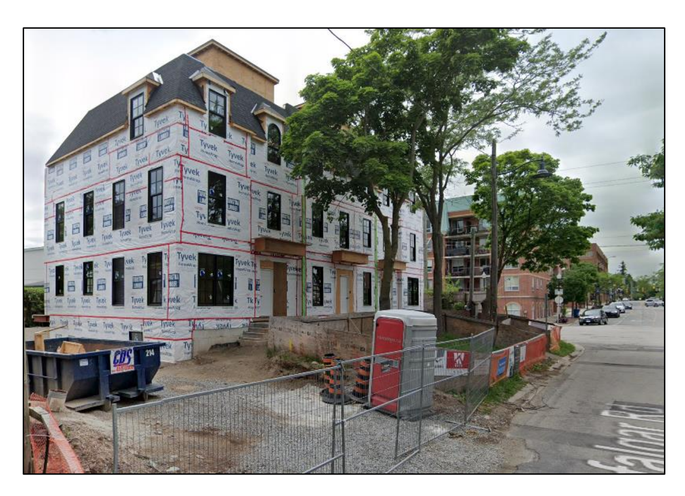
78 – 82 Trafalgar Road - Streetview

Section 45 of the Planning Act provides the Committee of Adjustment with the authority to authorize minor variance from the provisions of the Zoning By-law provided that requirements set out under 45(1) in the Planning Act are met.