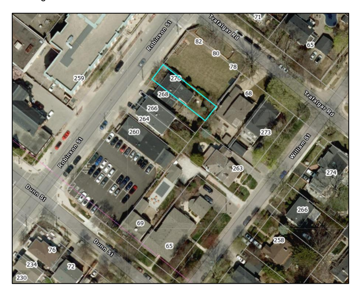
Aerial Photo – 270 Robinson Street

The subject lands are located within the medium density buffer that separates the Main Street area of Downtown Oakville from the Old Oakville Heritage Conservation District. The subject lands are currently listed on the Oakville Register of Properties of Cultural Value or Interest as a non-designated property. Heritage staff have noted that the subject property is located adjacent to the Heritage Conservation District; however, the proposal does not have an impact on the district. The surrounding area is comprised of existing low rise apartment buildings, existing and newer three-storey townhouse developments, existing and newer semi-detached dwellings and two-storey detached dwellings that contributes to the housing stock of the area. Dwellings in the surrounding area consist of a variety of architectural styles and design elements that maintain and contribute to the established neighbourhood character.