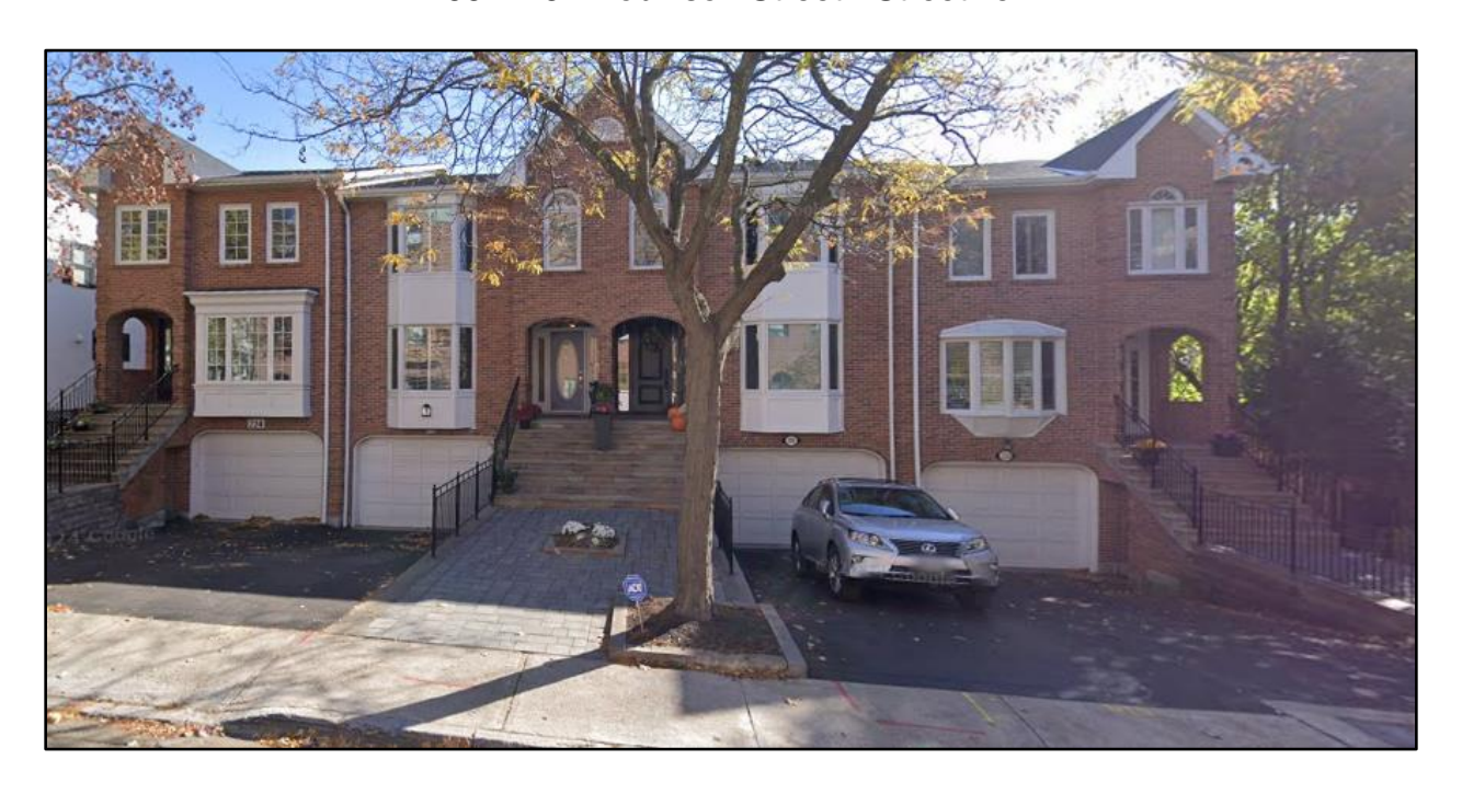
220 Robinson Street - Streetview