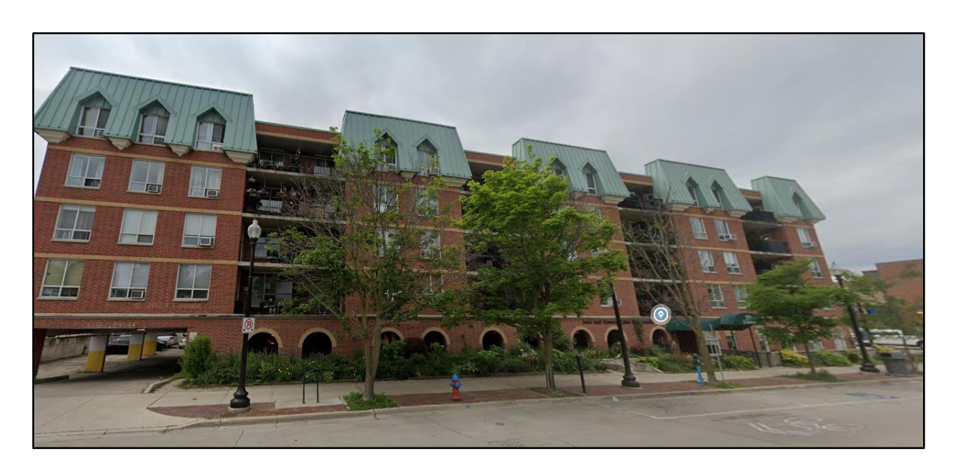
259 Robinson Street – Across from subject property