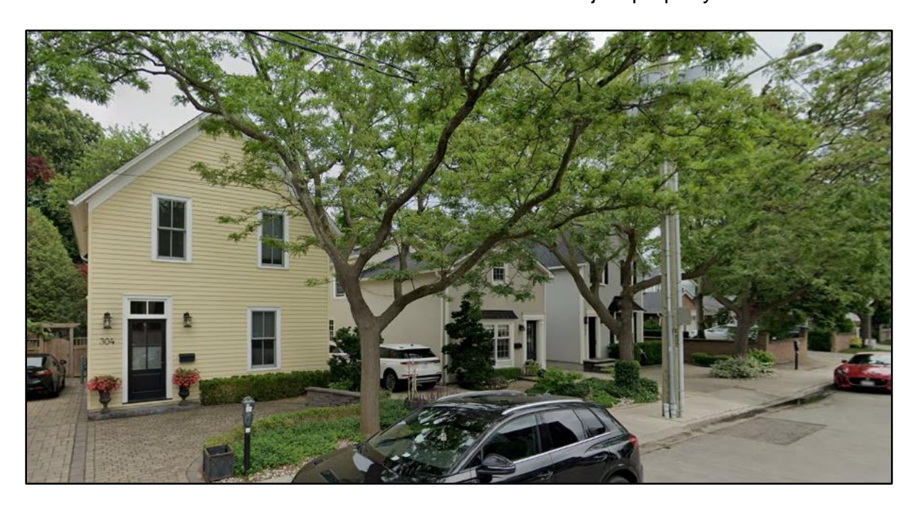
304 – 296 Robinson Street - Streetview