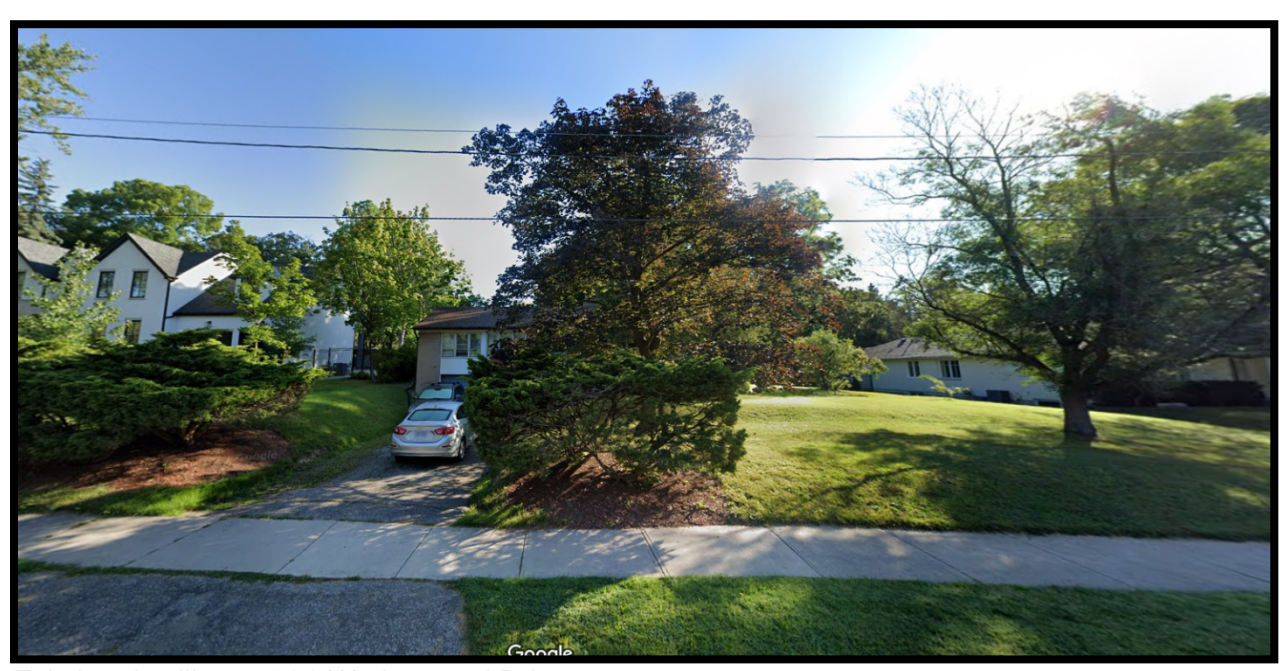
Existing dwelling at 221 Wedgewood Drive

The applicant has made a series of modifications to their proposal to better maintain the character of the neighbourhood. These changes have resulted in changes to the variances requested as follows: