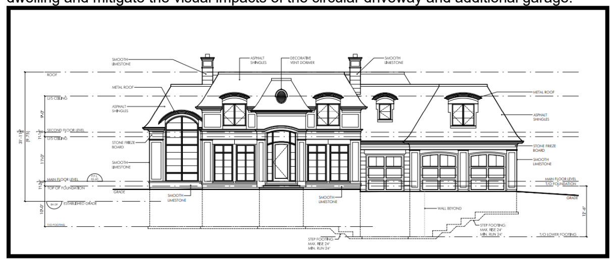
Previous Proposed dwelling at 221 Wedgewood

The modifications to the dwelling together with the reductions in the variances requested have resulted in a dwelling that is more compatible with the surrounding neighbourhood. Additionally, the applicant has included a robust landscape plan to further mitigate the massing of the dwelling and mitigate the visual impacts of the circular driveway and additional garage.