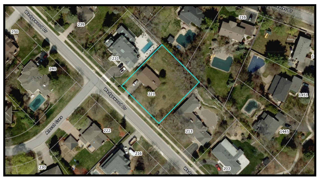
Aerial photo of 221 Wedgewood Drive