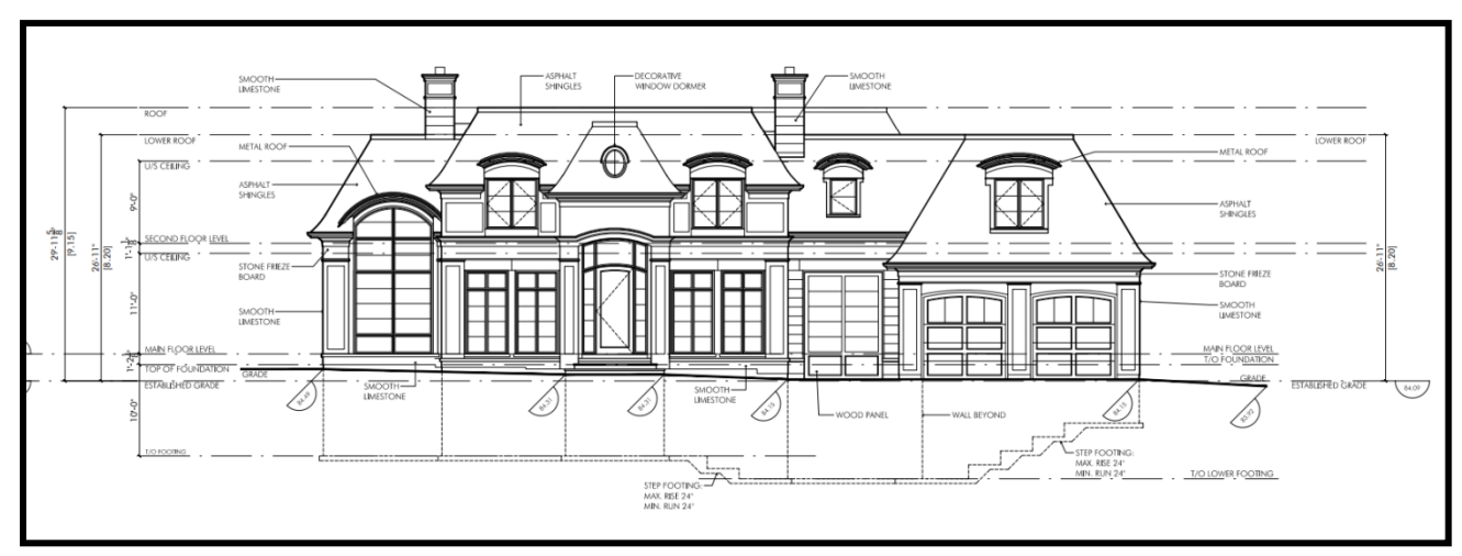
Revised Proposed Dwelling at 221 Wedgewood