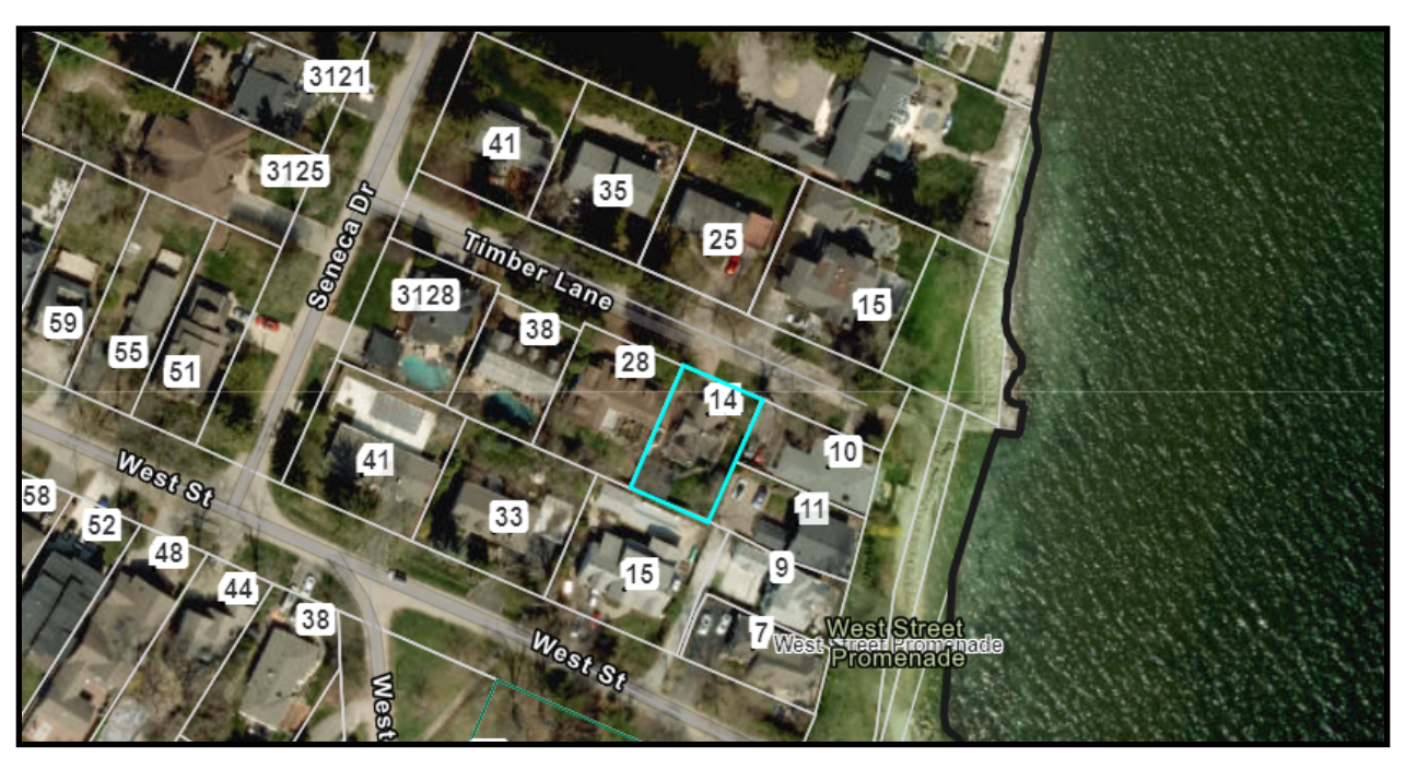
Aerial Photo – 14 Timber Lane

The subject site is also under Conservation Halton regulation. It is the Town's understanding that the applicant obtained a permit from Conservation Halton dated September 5, 2024.