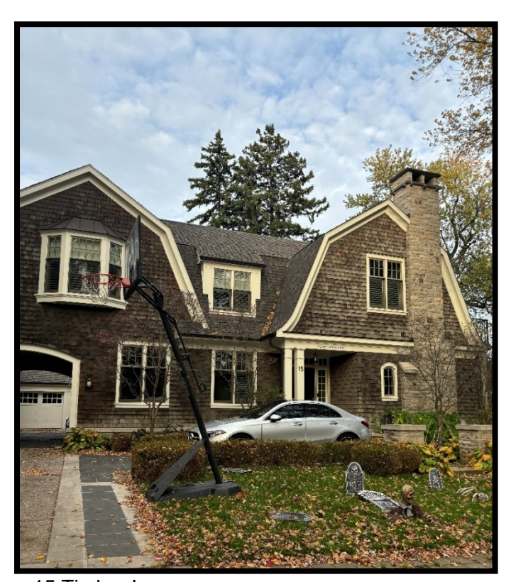
15 Timber Lane