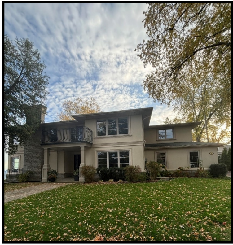
10 Timber Lane