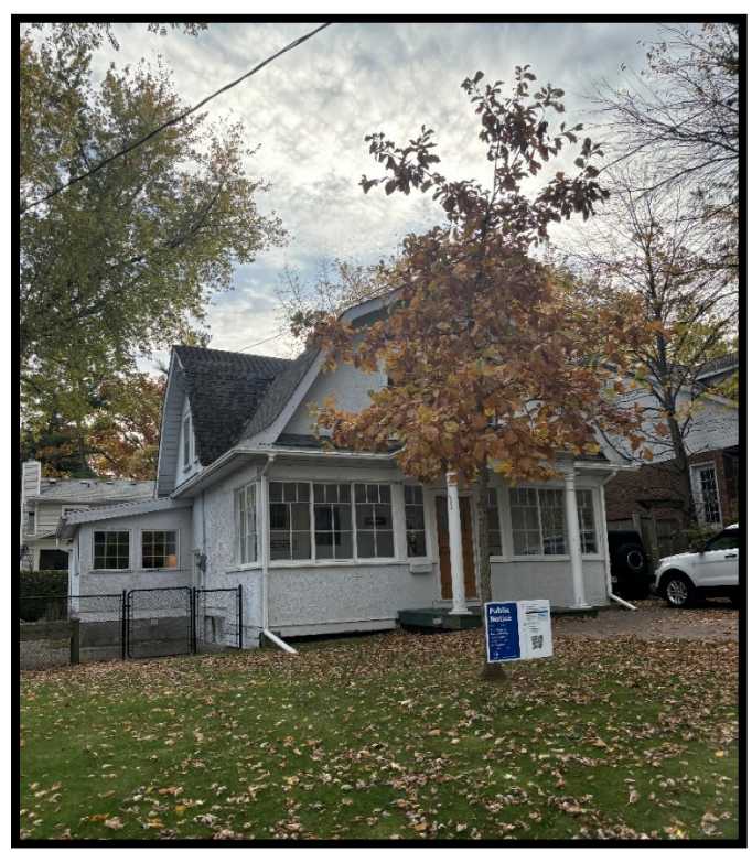
14 Timber Lane – Existing detached dwelling