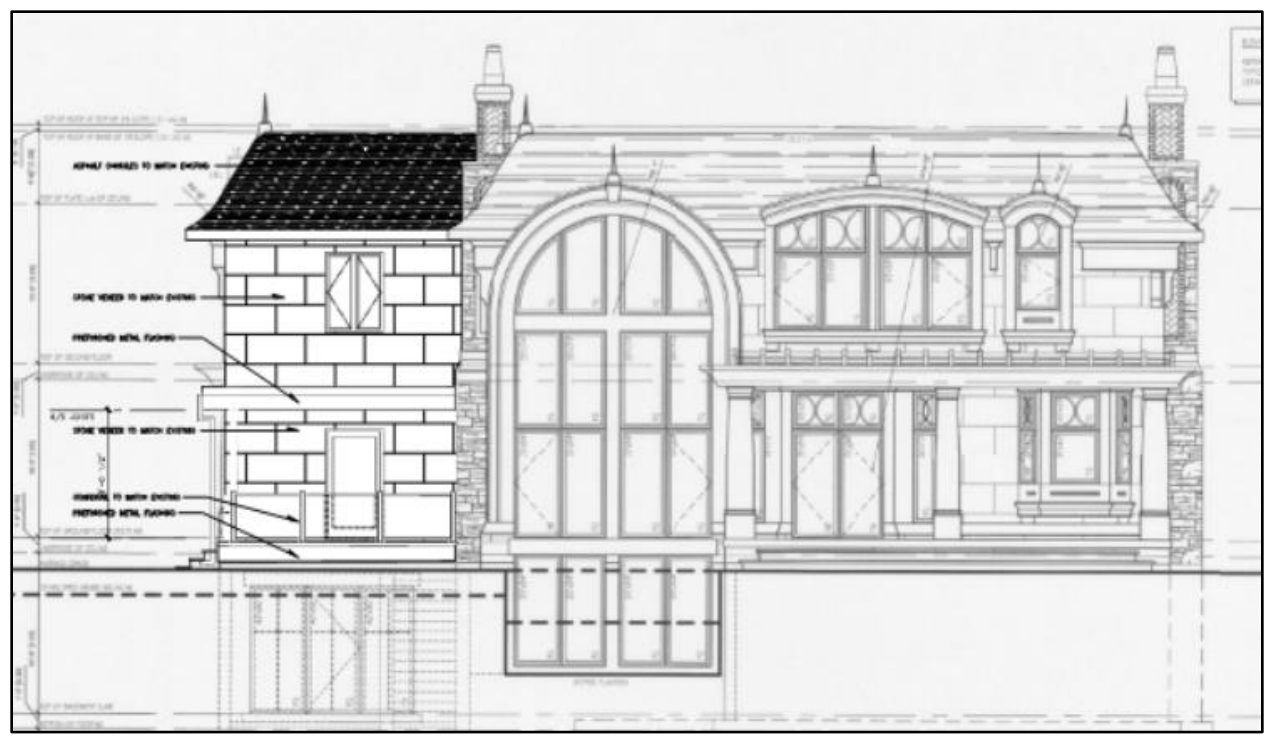
Rear Elevation - 372 Stanfield Drive