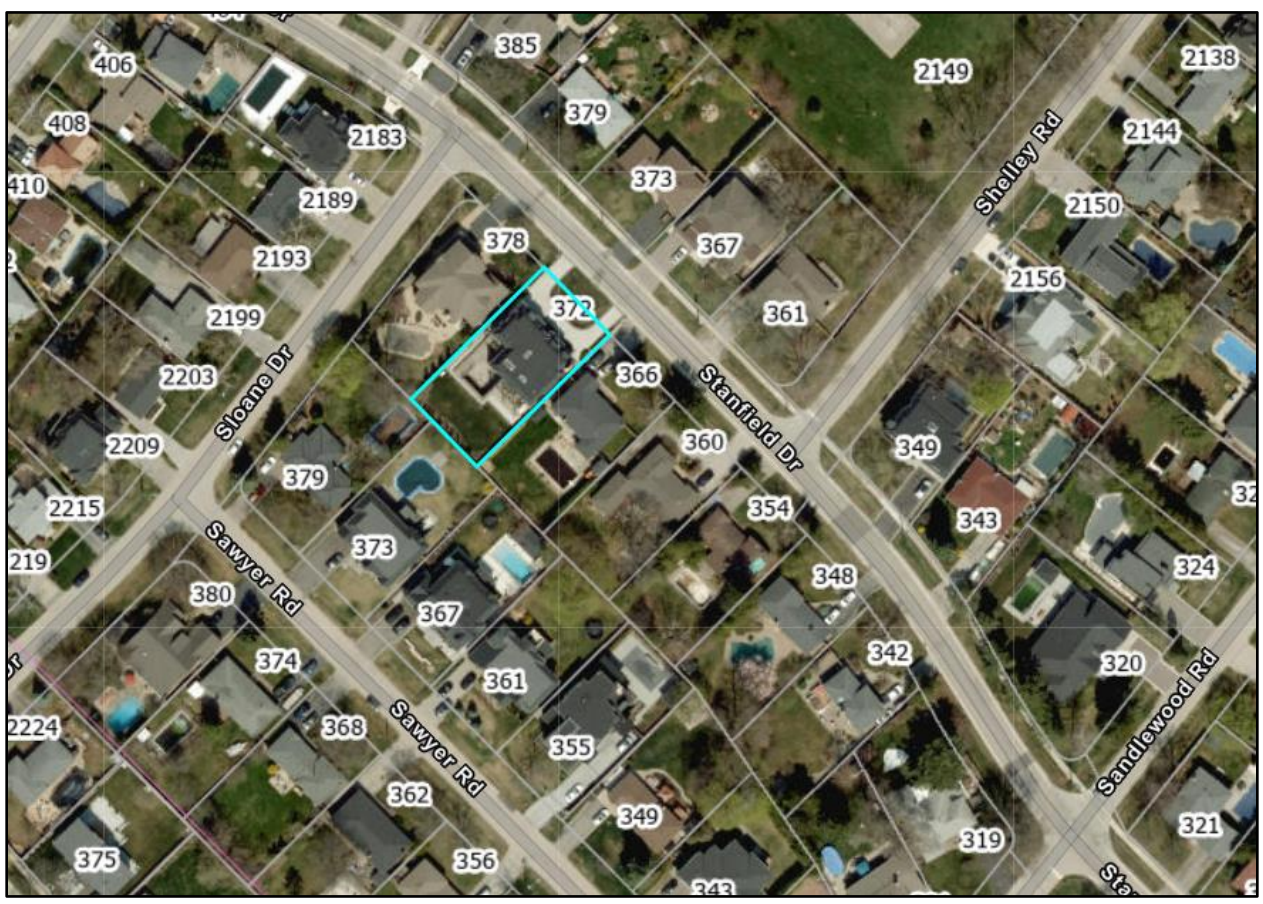
Aerial Photo - 372 Stanfield Drive

The Committee previously considered and granted approval for a variance (CAV A/109/2017) to permit an increase in the maximum residential floor area ratio from 37% to 39%. The dwelling has been constructed in general accordance with the previously submitted plans as part of CAV A/109/2017. The applicant is seeking additional permission to enhance the residential floor area and lot coverage of the dwelling by way of a rear yard two-storey addition.