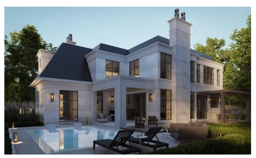
Rendering prepared by Applicant