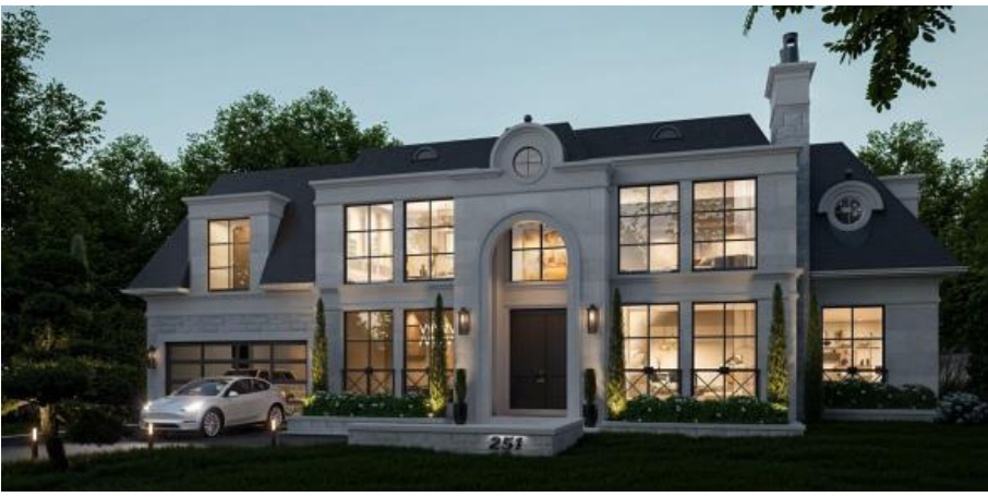
Rendering prepared by Applicant

The subject property is designated Low Density Residential by Livable Oakville. Development is required to be evaluated using the criteria established in Section 11.1.9 to maintain and protect the existing neighbourhood character. The dwelling is designed to have elements of the second floor in the roofline to minimize the impact of the proposed massing including a one storey covered porch which further breaks up the massing. The resulting massing of the proposed dwelling appears to be consistent with other dwellings in the neighbourhood, as well as the adjacent two storey dwellings. It is staff's opinion that the proposal maintains the general intent and purpose of the Official Plan.