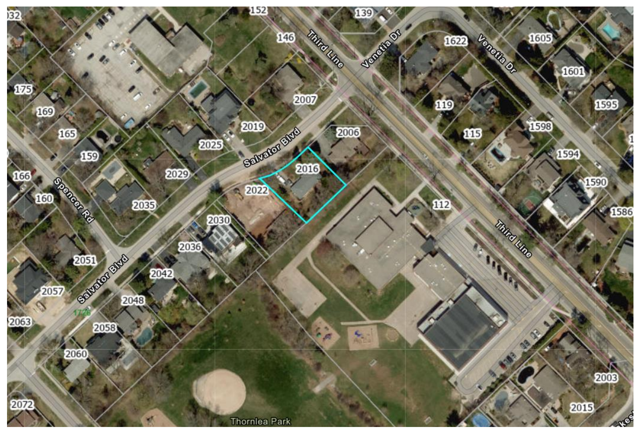
Aerial Photo – 2016 Salvator Boulevard