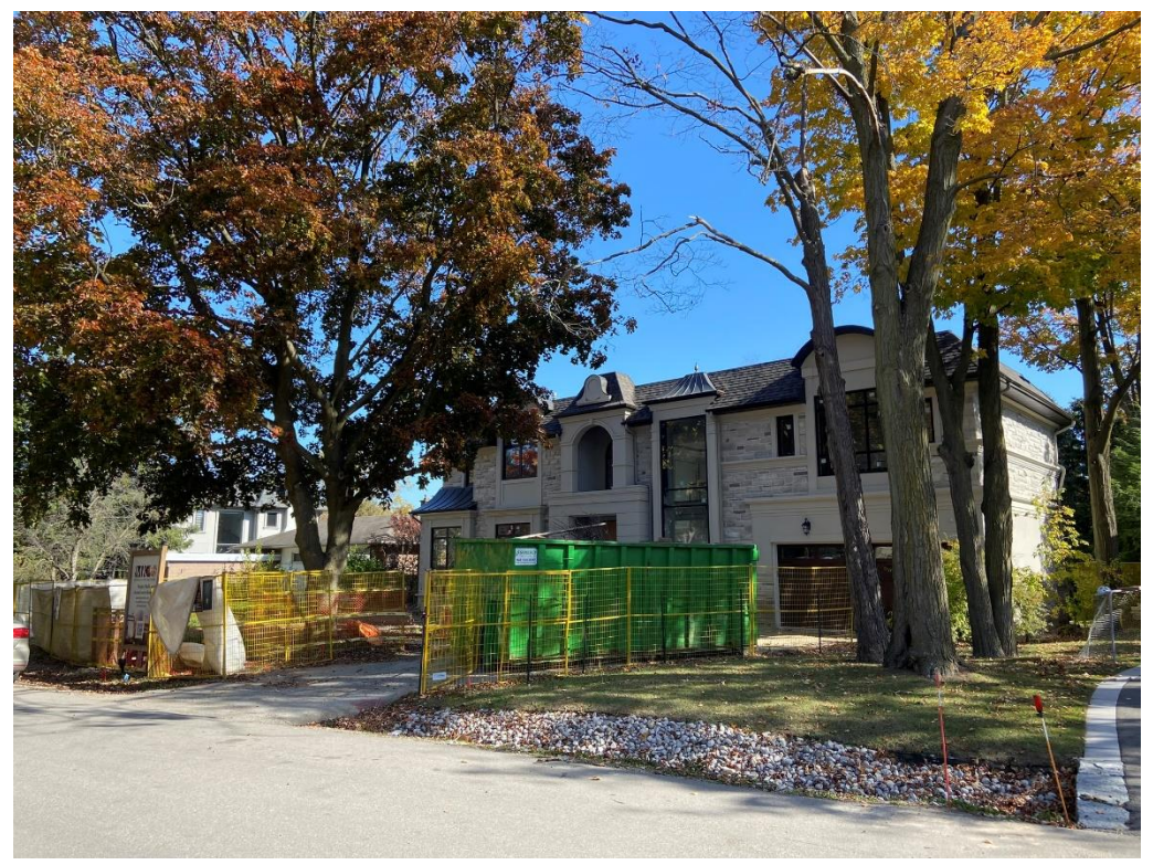
View of 2022 Salvator Blvd towards 2016 Salvator Blvd and 2006 Salvator Blvd – Taken Monday, October 21, 2024

There is a Bell Easement that runs along the westerly side yard which conflicts with a proposed window well and the location of the proposed pool. The pool is not subject to this application as it would be reviewed through a Site Alteration permit; however, if the Committee were to approve the proposed development, the applicant would be required to move the window well and proposed pool