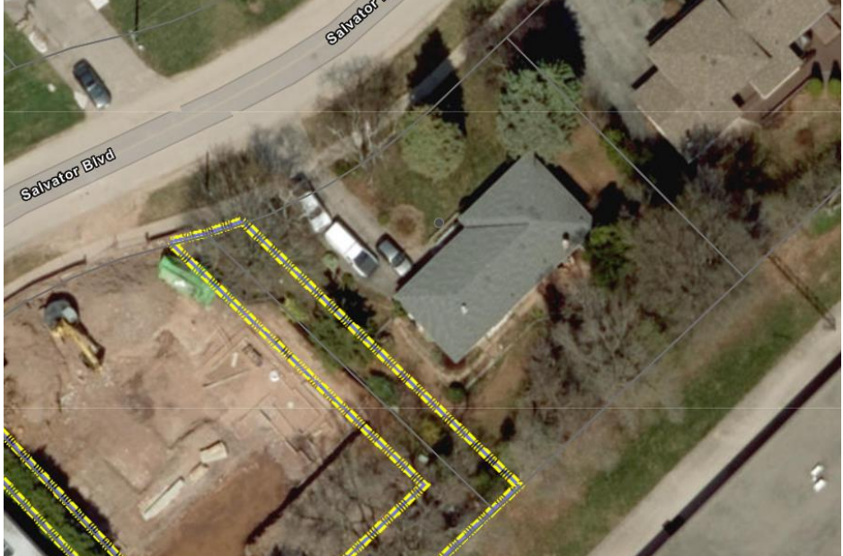
Town of Oakville Mapping depicting the location of the Bell Easement in side yard of 2016 Salvator

outside of the area impacted by the easement.