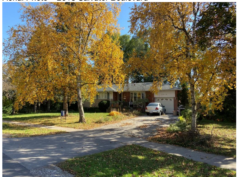
2016 Salvator Blvd - Taken Monday, October 21, 2024