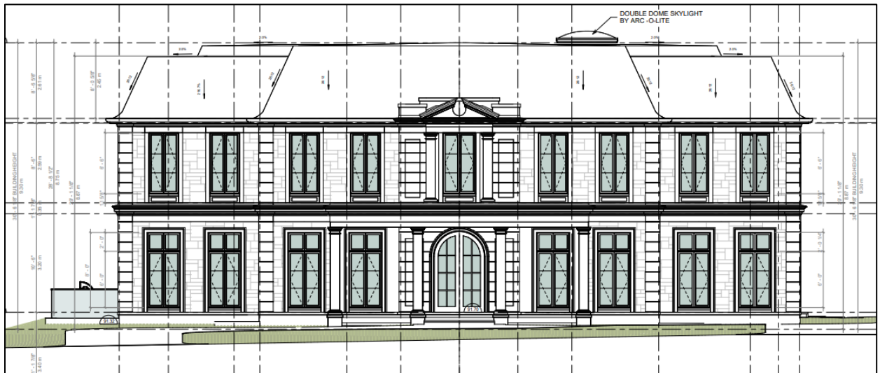
Front Elevation – October 2, 2024

Staff recognize that action has been taken to revise the variations being proposed, however, as demonstrated in the above elevations, the massing and scale of the dwelling proposed has not substantially changed from that brought forward to the Committee of Adjustment in May of 2024. Therefore, staff maintain their comments previously shared with the Committee of Adjustment dated May 29, 2024.