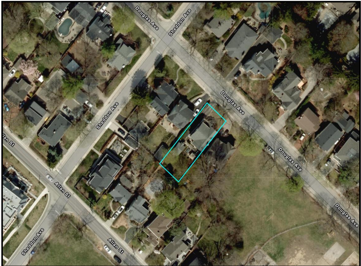
Aerial Photo – 246 Douglas Avenue

The subject lands are located within the Brantwood neighbourhood (RL3-0 SP: 10) which has seen past variance approvals for increases in the maximum lot coverage from 25% to approximately 30%. This area has experienced redevelopment in the form of replacement dwellings and additions/alterations to existing dwellings. The neighbourhood consists of original one-storey, one-half-storey, and two-storey detached dwellings, as well as newer two-storey detached dwellings. Newer two-storey dwellings in the surrounding area consist of a variety of architectural forms, many of which include one-storey architectural elements that assist in breaking up the massing.