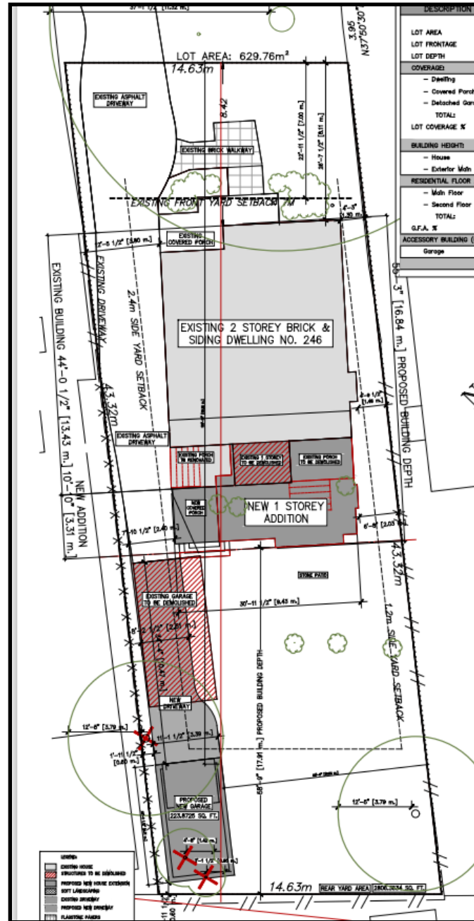
Site Plan – 246 Douglas Avenue

illustrates the existing dwelling footprint and detached garage location, along with the proposed one-storey rear addition and new garage on the property.