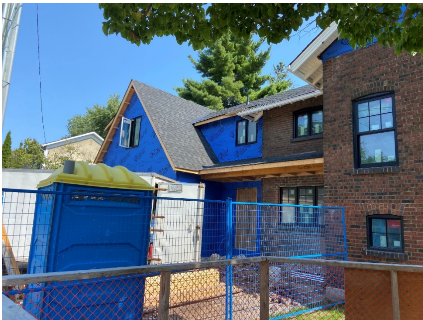
Subject dwelling under construction, taken September 5, 2024