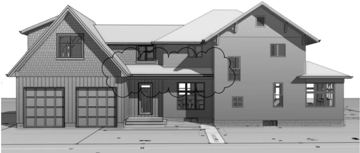
Proposed elevation prepared by applicant