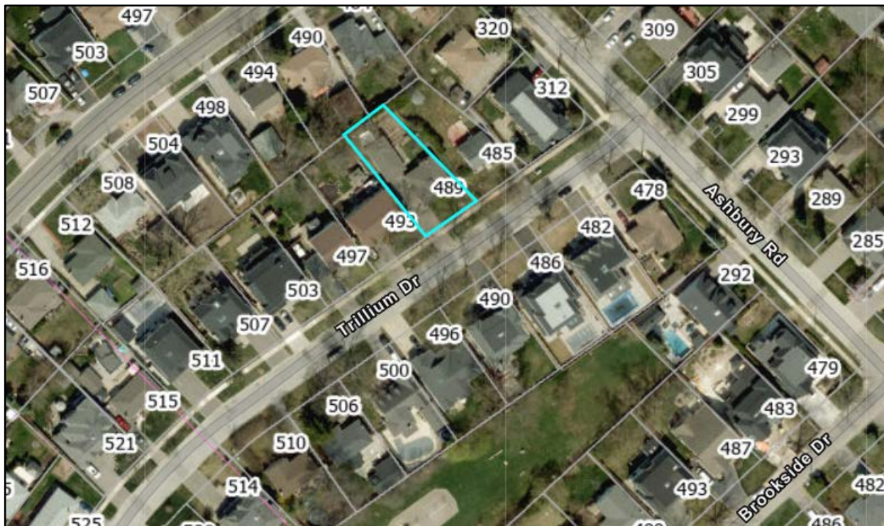
Aerial Photo – 489 Trillium Drive

The subject property is located in an area that has experienced redevelopment in the form of replacement dwellings and additions/alterations to existing dwellings. The neighbourhood consists of original one-storey, one-half-storey, and two-storey detached dwellings, as well as newer two-storey detached dwellings. Newer two-storey dwellings in the surrounding area consist of a variety of architectural forms. The subject site is situated between two newer, two-storey detached dwellings with a number of newer two-storey dwellings in the immediate area.