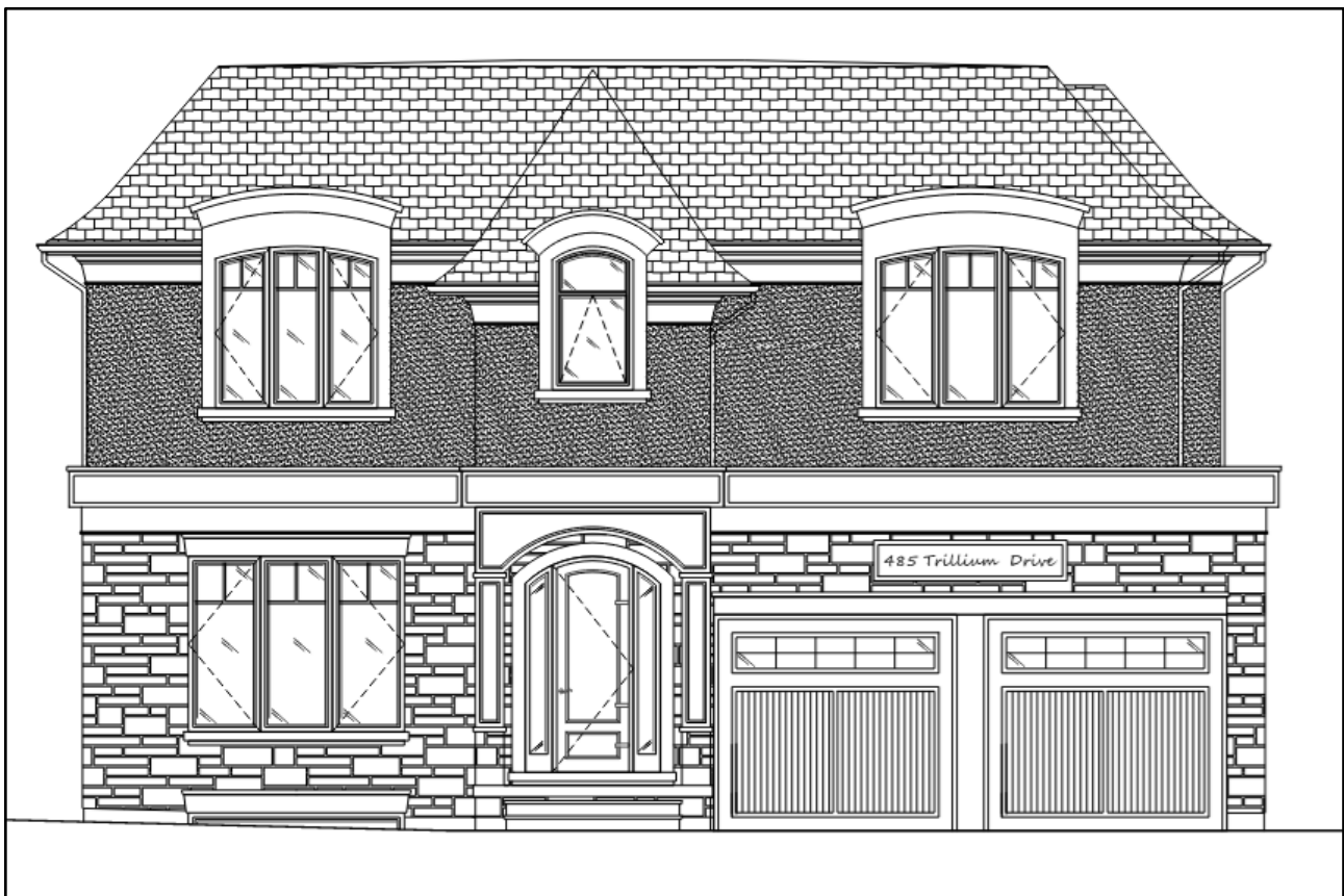
Newly Constructed Neighbouring Dwelling (CAV A/146/2021) – 485 Trillium Drive

Section 45 of the Planning Act provides the Committee of Adjustment with the authority to authorize minor variance from the provisions of the Zoning By-law provided the requirements set out under 45(1) in the Planning Act are met.