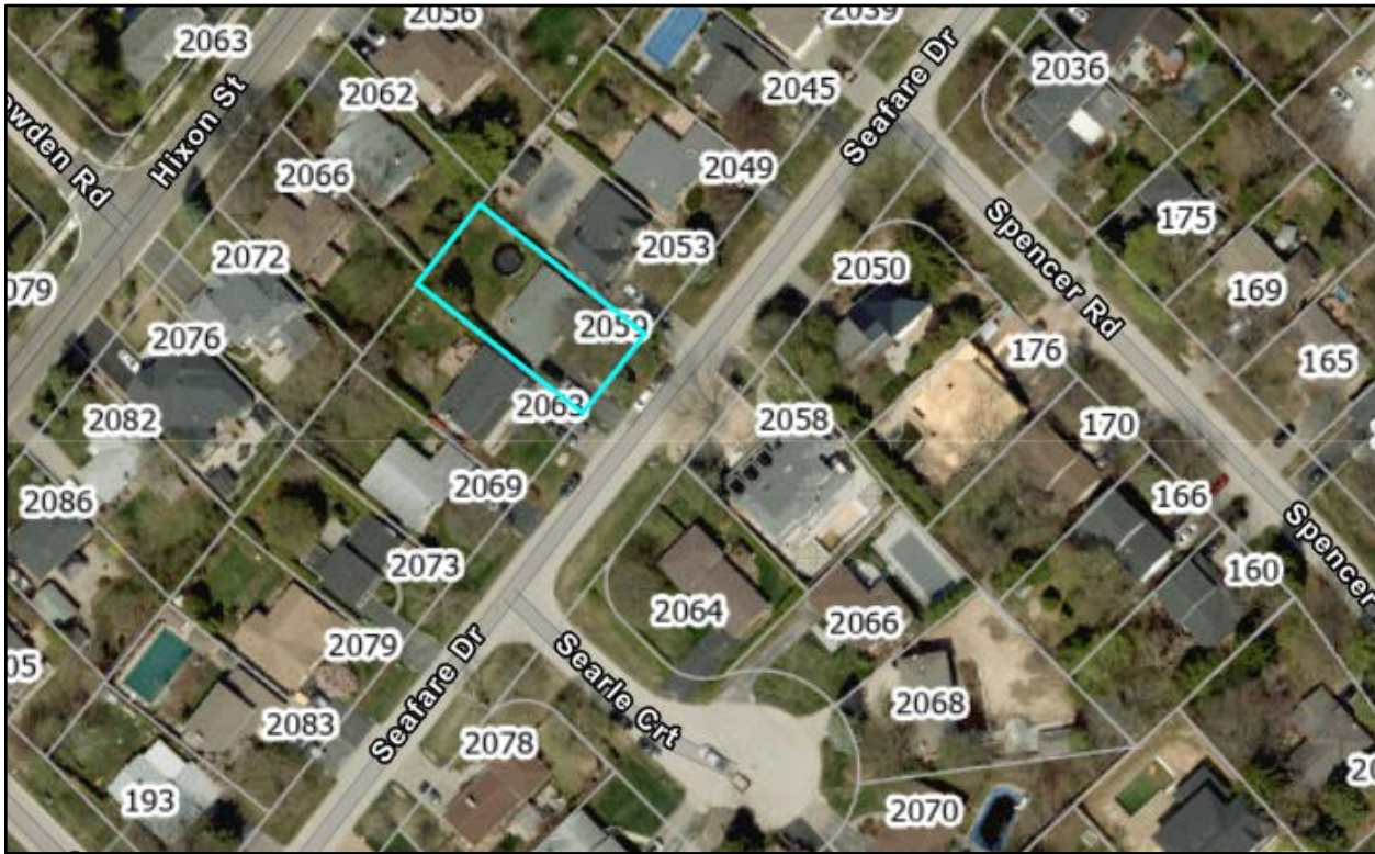
Aerial Photo – 2059 Seafare Drive

The subject property is located in an area that has experienced redevelopment in the form of replacement dwellings and additions/alterations to existing dwellings. The neighbourhood consists of original one-storey, one-half-storey, and two-storey detached dwellings, as well as newer two-storey detached dwellings. Newer two-storey dwellings in the surrounding area consist of a variety of architectural forms.