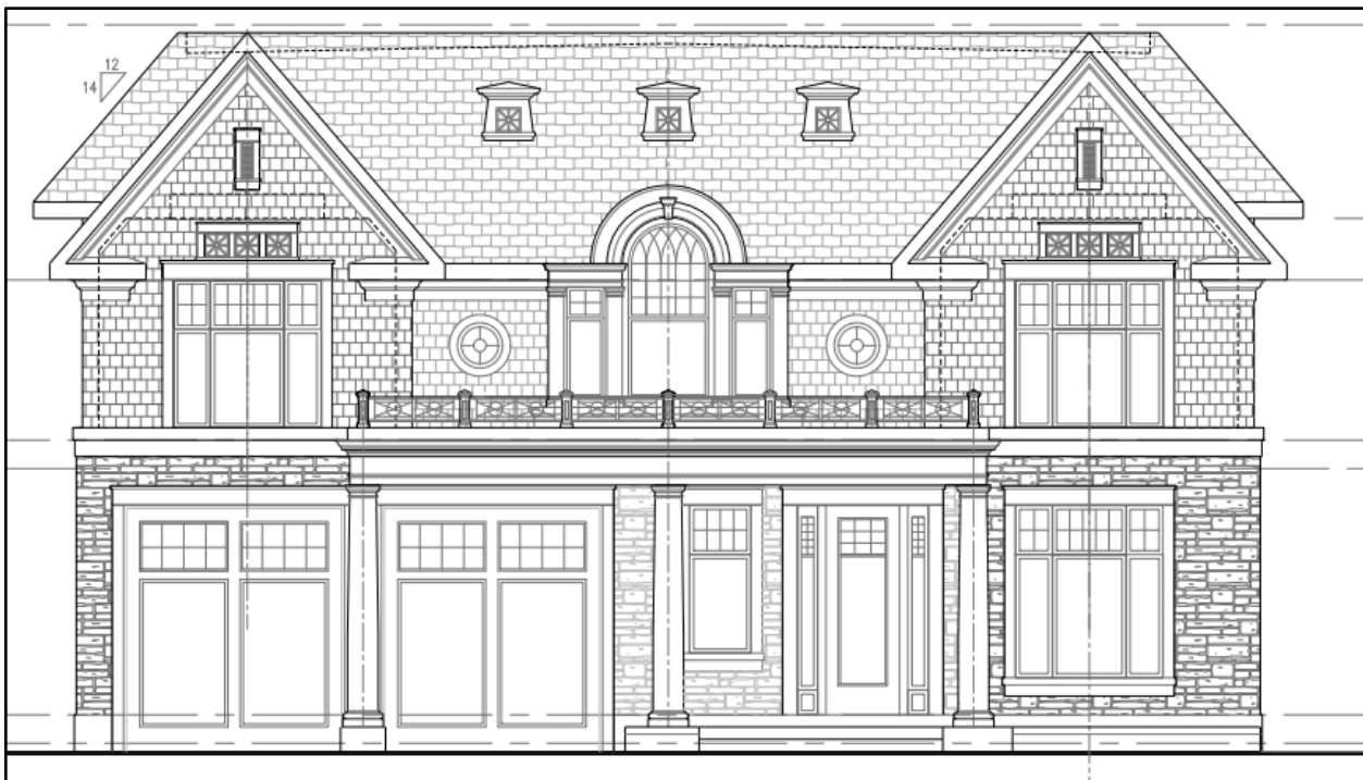
Front Elevation – 2059 Seafare Drive