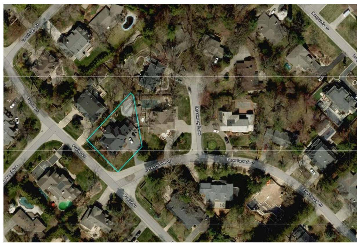
Aerial Photo - 269 Forestwood Drive

The subject property is located on the corner of Poplar Drive and Forestwood Drive, as seen in the aerial photo below. The neighbourhood consists of large lots containing one-storey and two-storey dwellings.