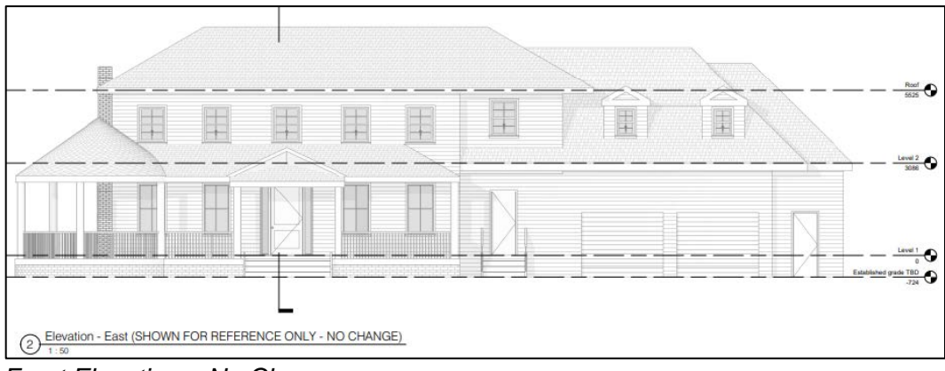
Front Elevation - No Change

Staff understand that the increased residential floor area ratio will not impact the exterior façade of the existing dwelling.