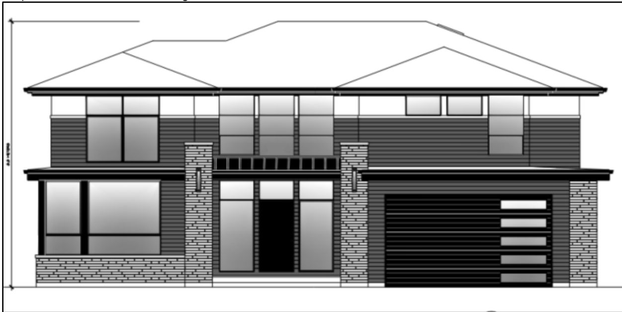
Proposed Front Elevation – August 23, 2023 (Approved)

Section 45 of the Planning Act provides the Committee of Adjustment with the authority to authorize minor variances from provisions of the Zoning By-law provided the requirements set out under 45(1) in the Planning Act are met. Staff comments concerning the application of the four tests to this minor variance request are as follows: