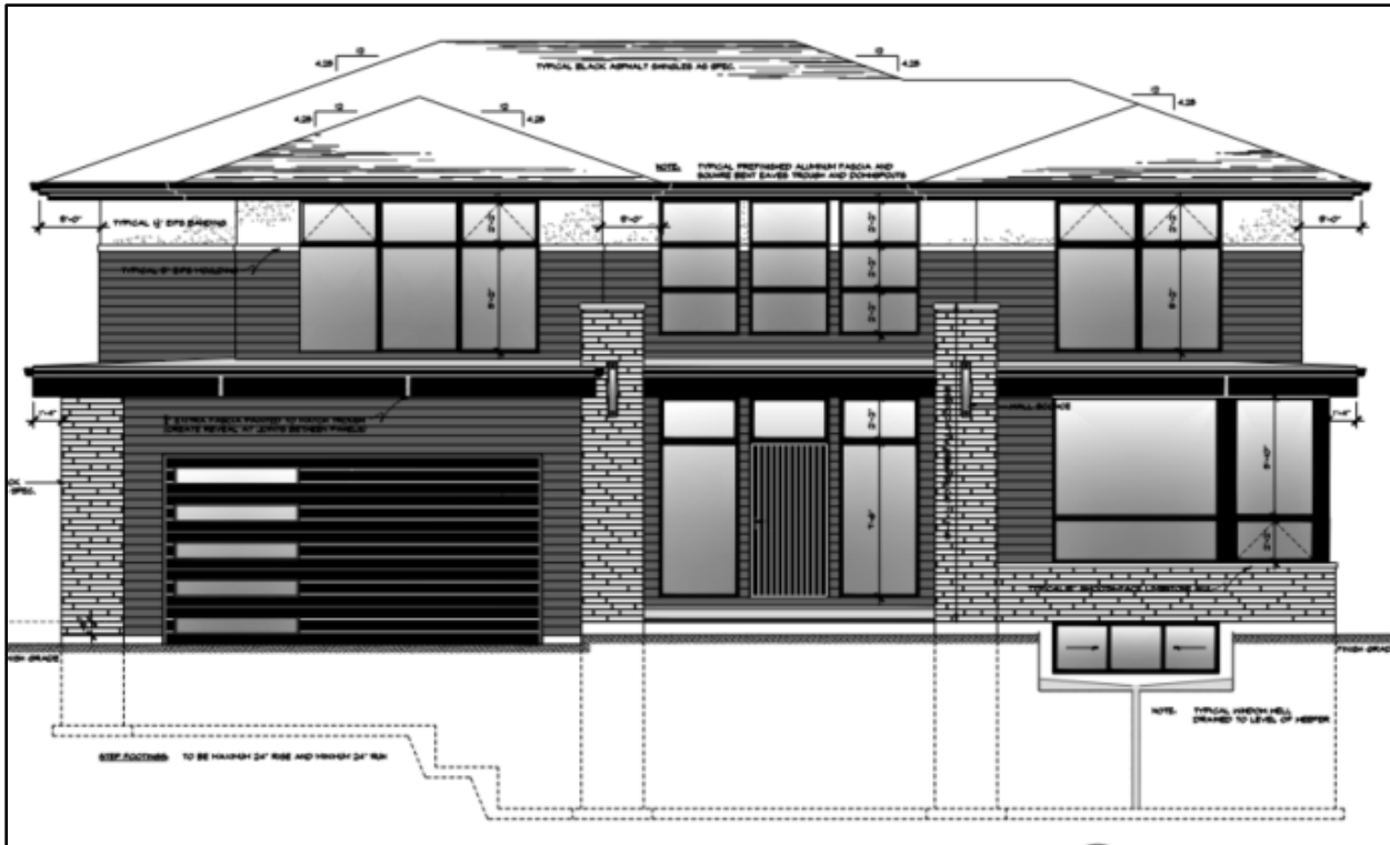
Proposed Front Elevation – August 7, 2024