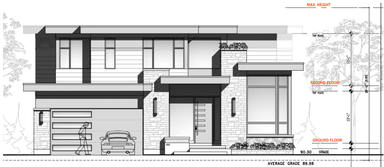
Excerpt of Front Elevation prepared by Applicant