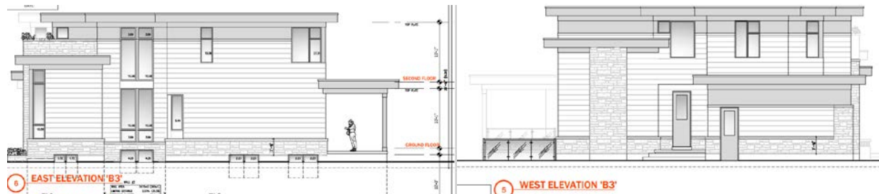
Excerpts of East and West Elevations prepared by Applicant

Section 45 of the Planning Act provides the Committee of Adjustment with the authority to authorize minor variances from provisions of the Zoning By-law provided the requirements set out under 45(1) in the Planning Act are met. Staff comments concerning the application of the four tests to this minor variance request are as follows: