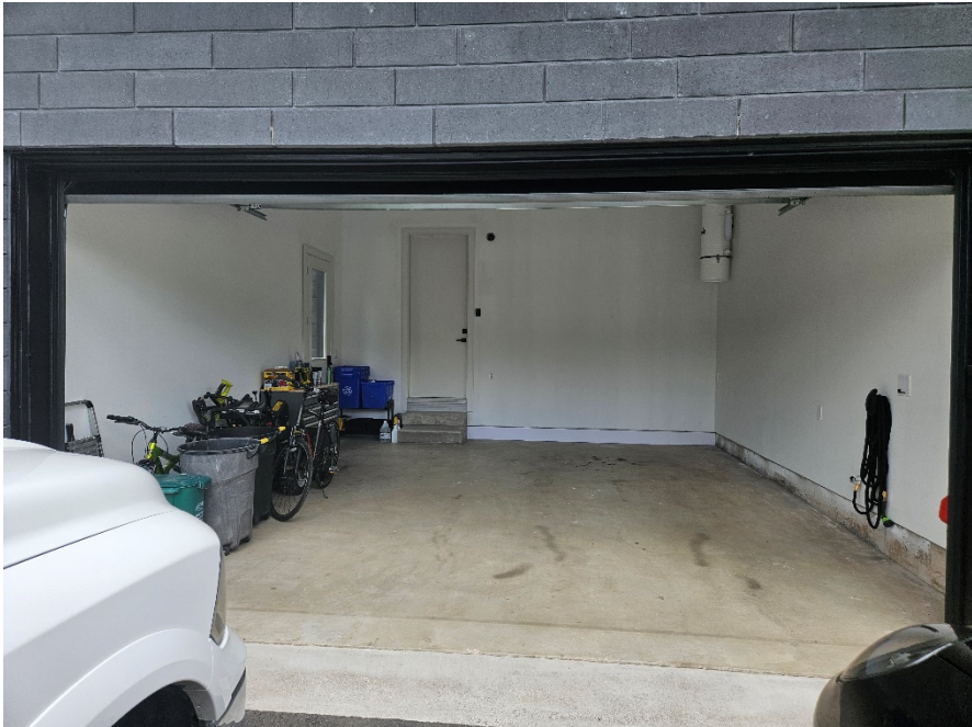
270 Vilma Drive Garage – Taken on July 11, 2024

Section 45 of the Planning Act provides the Committee of Adjustment with the authority to authorize minor variances from provisions of the Zoning By-law provided the requirements set out under 45(1) in the Planning Act are met. Staff comments concerning the application of the four tests to this minor variance request are as follows: