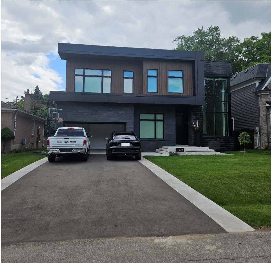
270 Vilma Drive – Taken on July 11, 2024