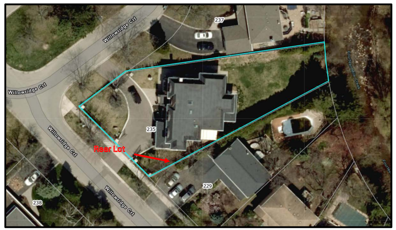
Figure 1 – Aerial Photo

The subject lands contain a newly constructed two-storey detached dwelling in a neighbourhood that consists predominantly of the original housing stock. The original housing stock is primarily two-storey dwellings. The dwelling is also situated within a court, and is defined as being a corner lot due to the road allowance configuration, as shown in Figure 1 below. Due to the lot's irregular shape, the rear lot line is considered to be the southern most lot line.