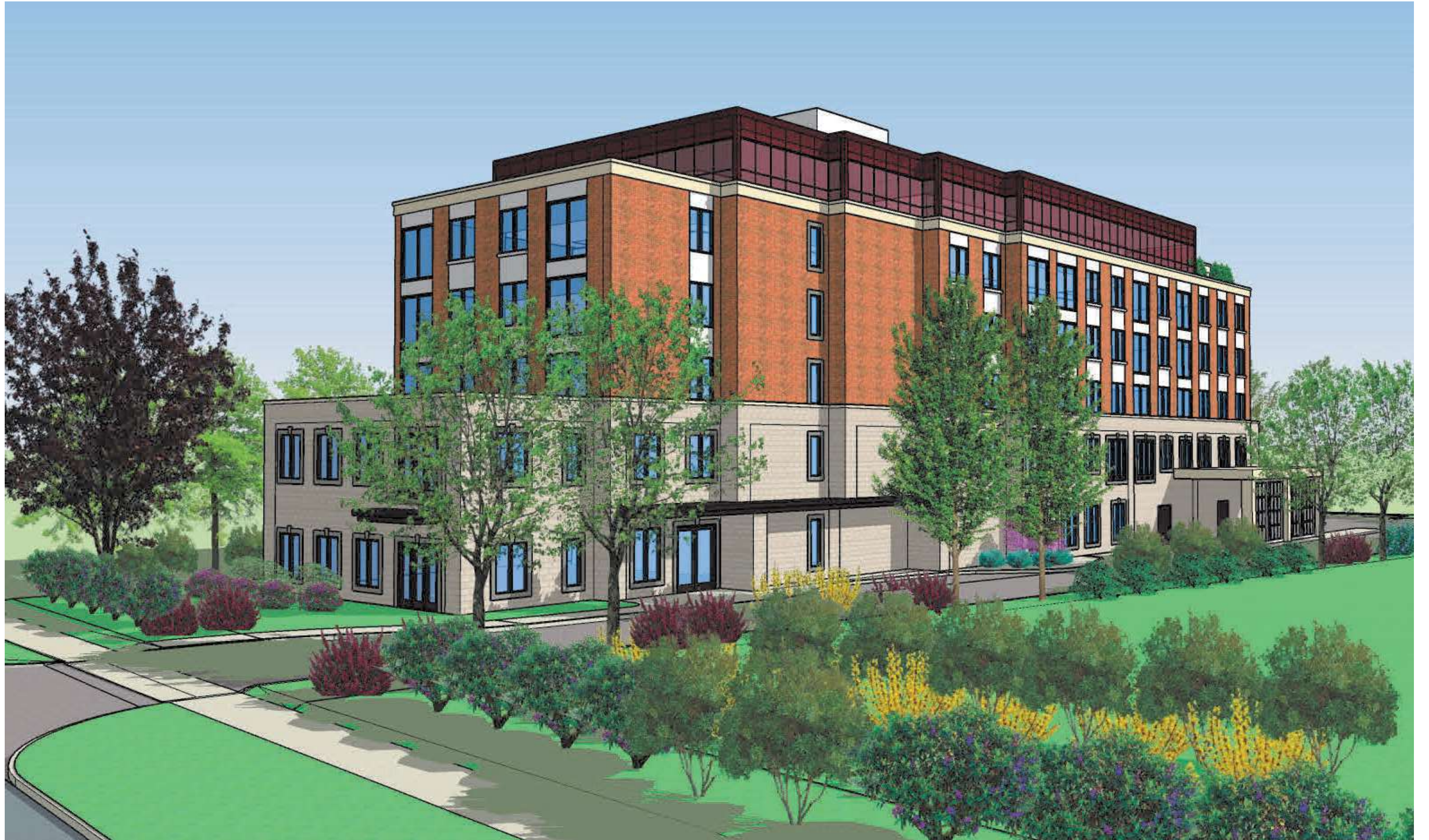
1295 Sixth Line, Oakville