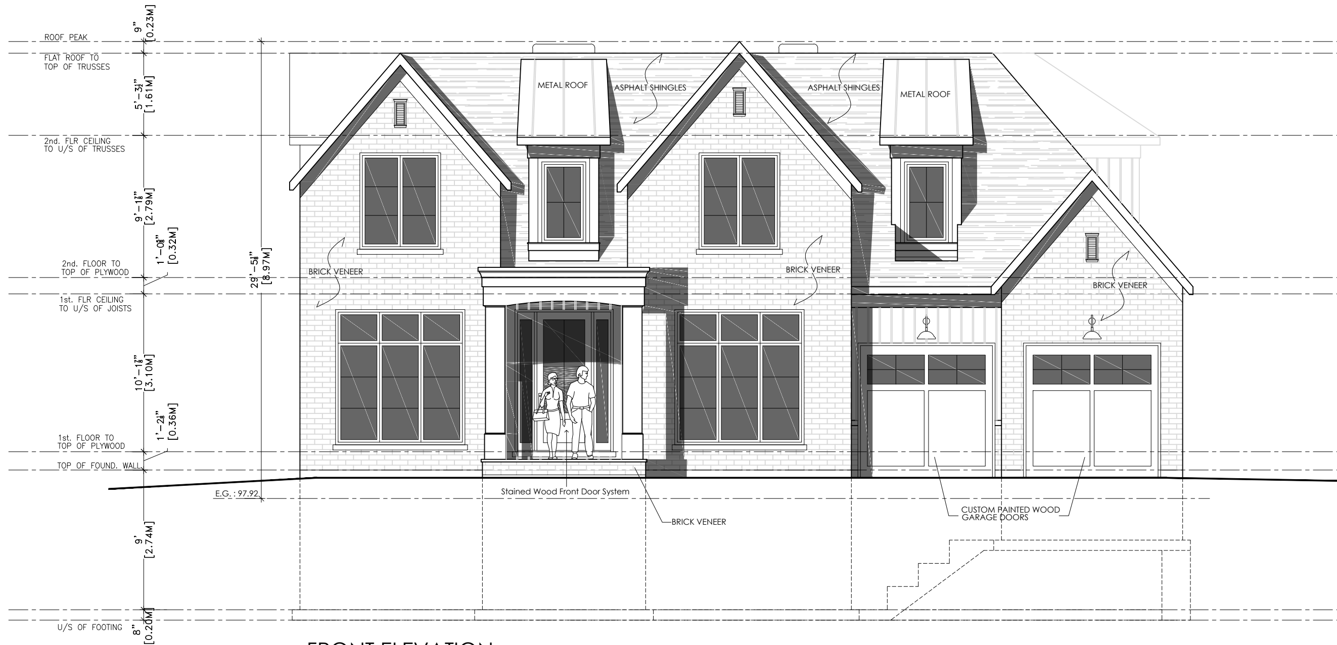
FRONT ELEVATION SCALE: 1:75