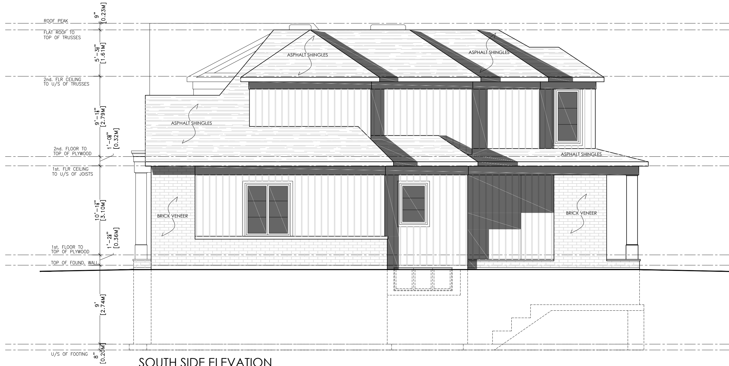
SOUTH SIDE ELEVATION SCALE: 1:75