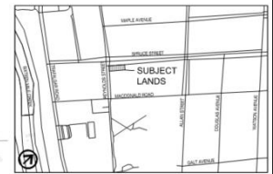
KEY PLAN SCALE: 1:1000

DRAFT PLAN OF SUBDIVISION PART OF BLOCK A REGISTERED PLAN 121 TOWN OF OAKVILLE REGIONAL MUNICIPALITY OF HALTON 1:400