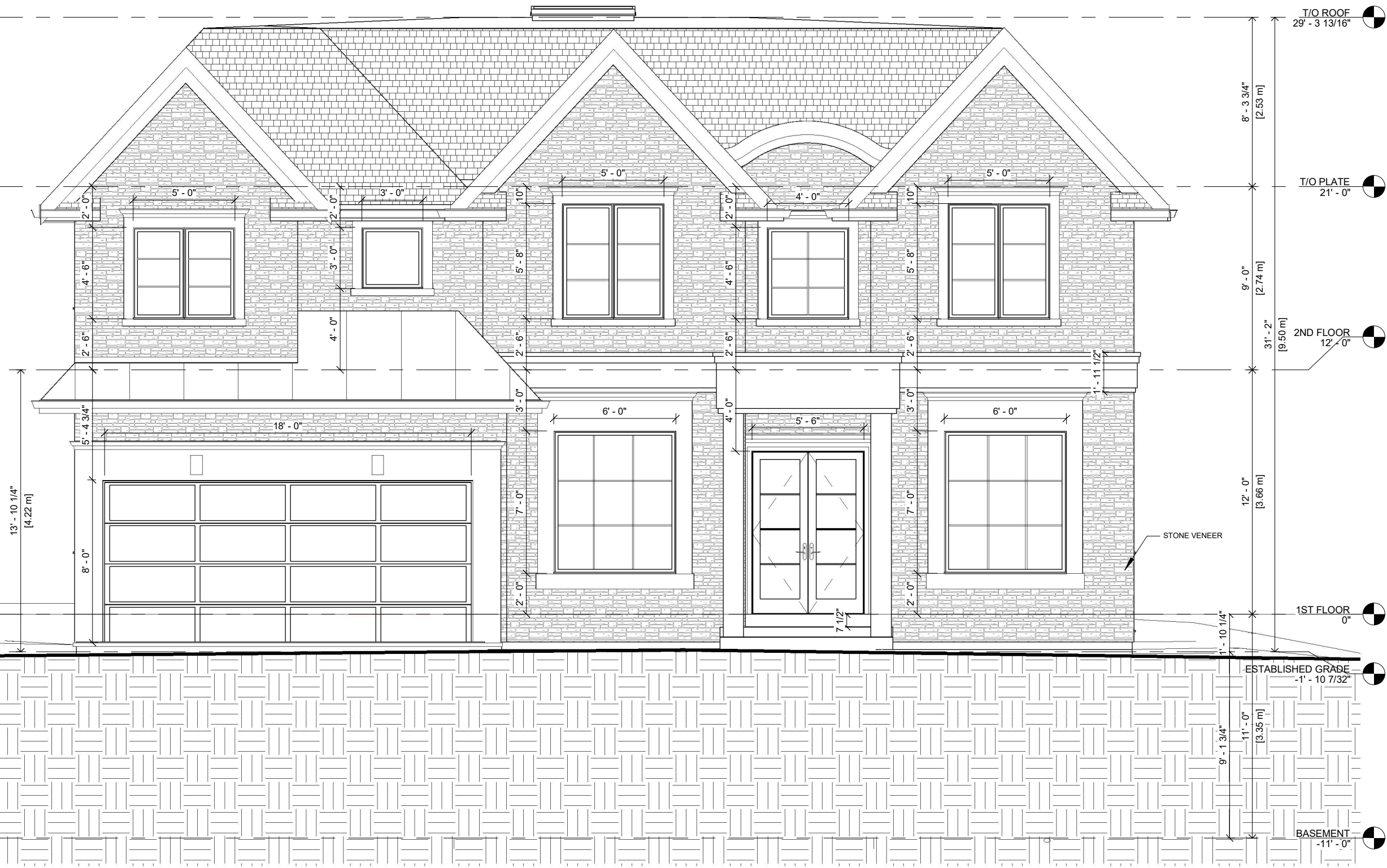
1 EAST ELEVATION 3/16" = 1'-0"

GENERAL NOTES: CONTRACTOR SHALL VERIFY ALL DIMENTIONS AND ALL JOB SITE CONDITIONS PRIOR TO PROCEEDING WITH CONSTRUCTION AND REPORT ANY DISCREPANCIES IMMEDIATELY TO THE DESIGNER. ONLY THE LATEST APPROVED DRAWINGS ARE TO BE USED FOR CONSTRUCTION.