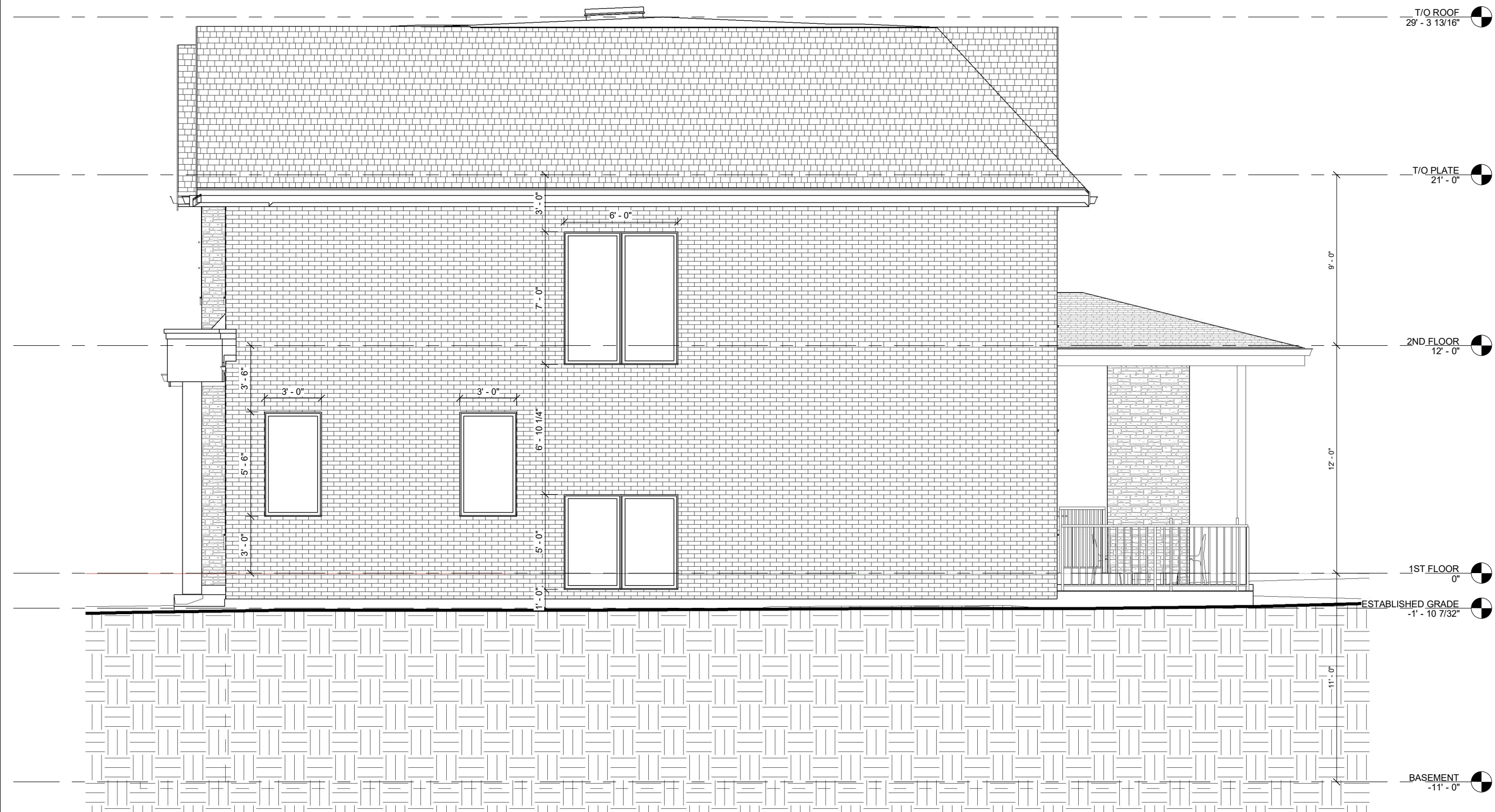
1 NORTH ELEVATION 3/16" = 1'-0"

GENERAL NOTES: CONTRACTOR SHALL VERIFY ALL DIMENTIONS AND ALL JOB SITE CONDITIONS PRIOR TO PROCEEDING WITH CONSTRUCTION AND REPORT ANY DISCREPANCIES IMMEDIATELY TO THE DESIGNER. ONLY THE LATEST APPROVED DRAWINGS ARE TO BE USED FOR CONSTRUCTION.