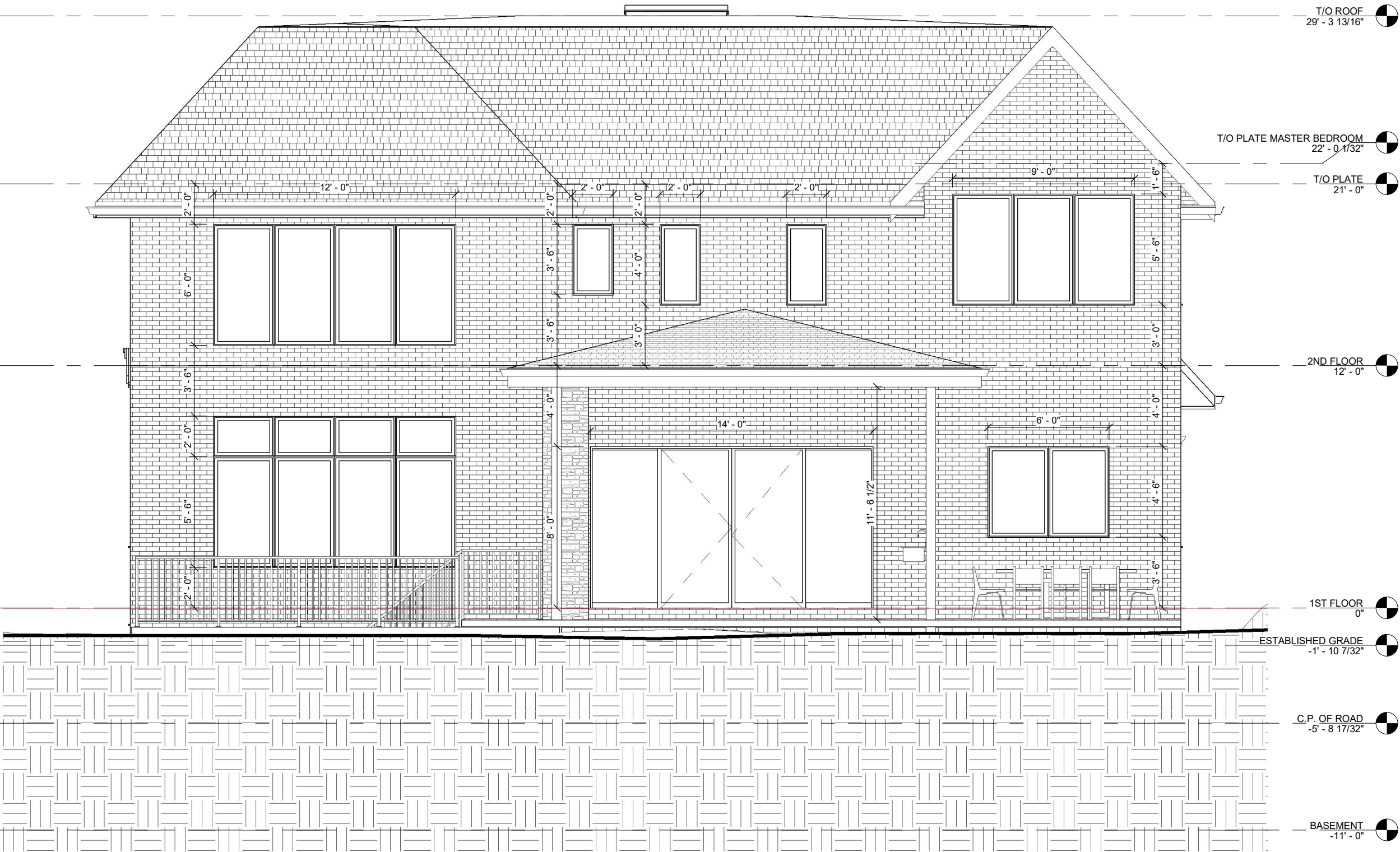
1 WEST ELEVATION 3/16" = 1'-0"

GENERAL NOTES: CONTRACTOR SHALL VERIFY ALL DIMENTIONS AND ALL JOB SITE CONDITIONS PRIOR TO PROCEEDING WITH CONSTRUCTION AND REPORT ANY DISCREPANCIES IMMEDIATELY TO THE DESIGNER. ONLY THE LATEST APPROVED DRAWINGS ARE TO BE USED FOR CONSTRUCTION.