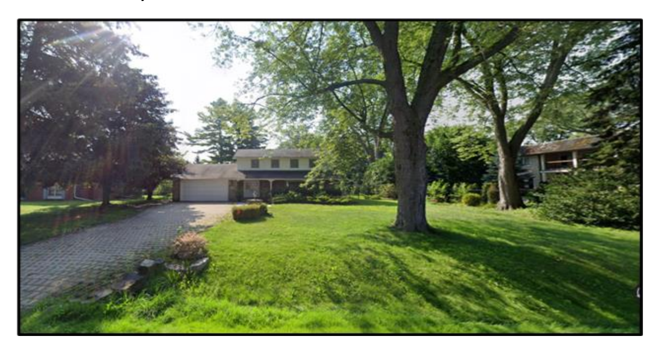
Street View of subject lands – 1260 Cleaver Drive (South side of Cleaver Drive)