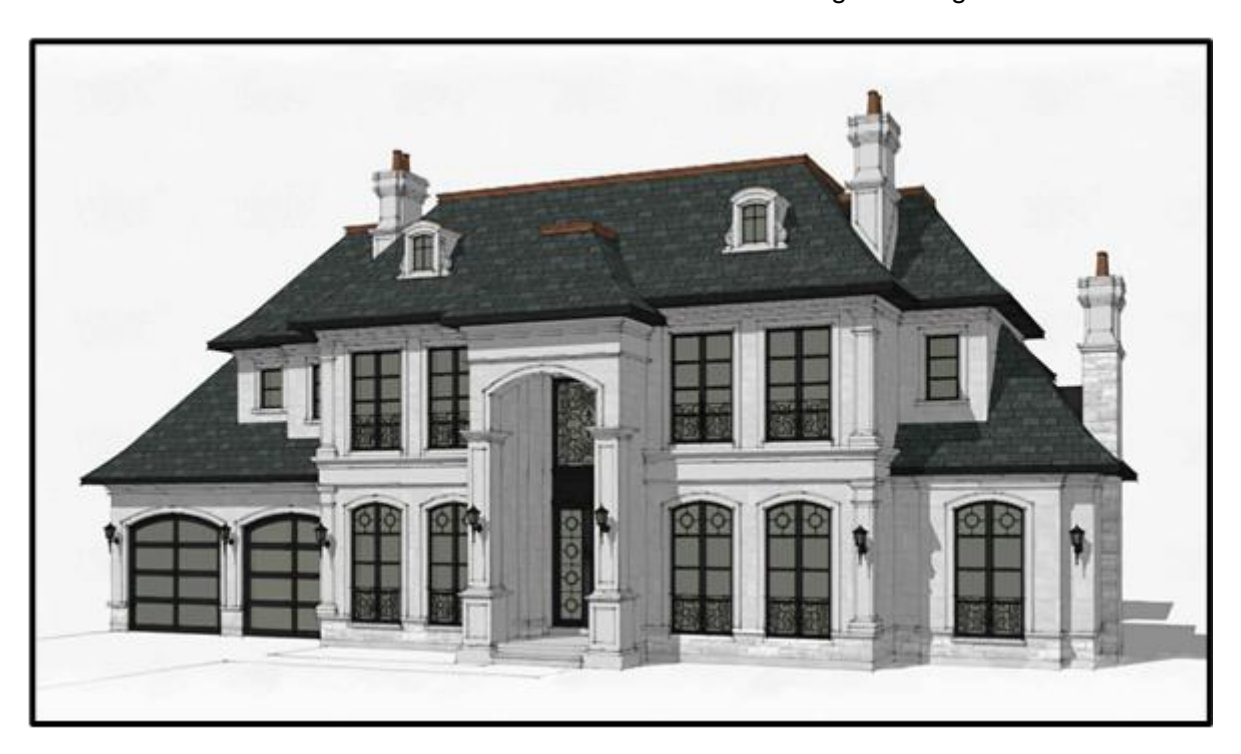
1260 Cleaver Drive - Proposed Dwelling Rendering

In Staff's opinion, the proposed height and overall design of the dwelling have not been properly considered when examining it against the existing character of the stable residential neighbourhood it is located in. As such, the proposal results in a development that appears to