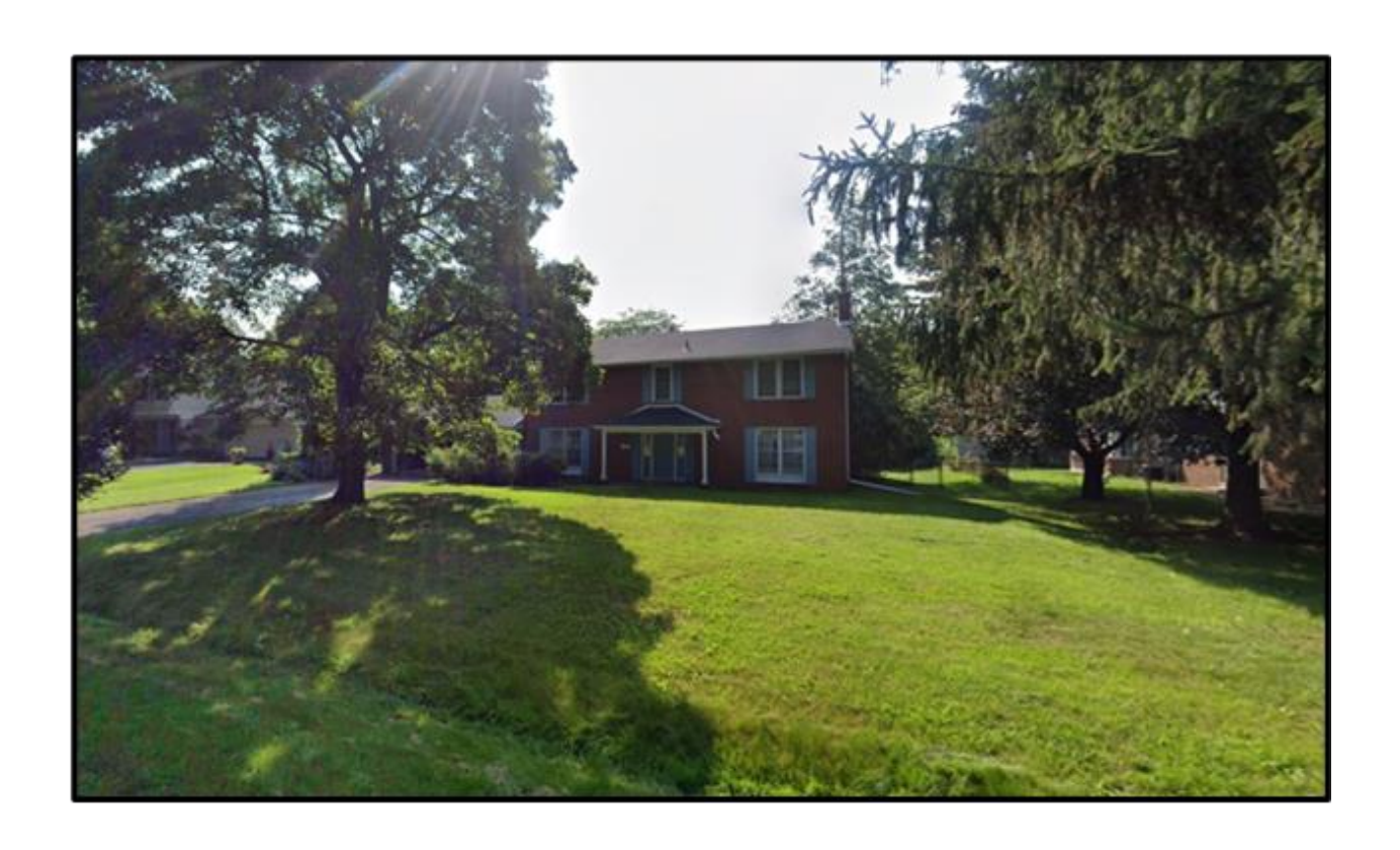
Street View of neighbouring dwelling located east of the subject lands (1268 Cleaver Drive)