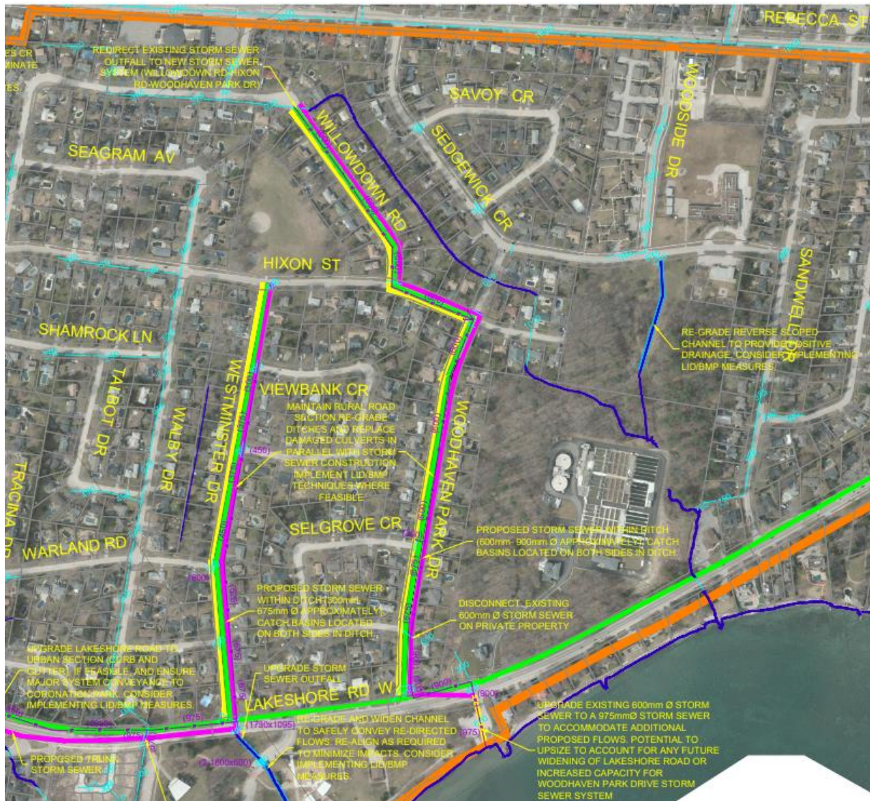
Figure 1 – recommendations from the 2017 Coronation Park Drainage Improvements Class EA

Figure 1 illustrates the recommendations of the Coronation Park EA, which include works on both Westminster Drive and Woodhaven Park Drive (Willowdown Road and Hixon Street):