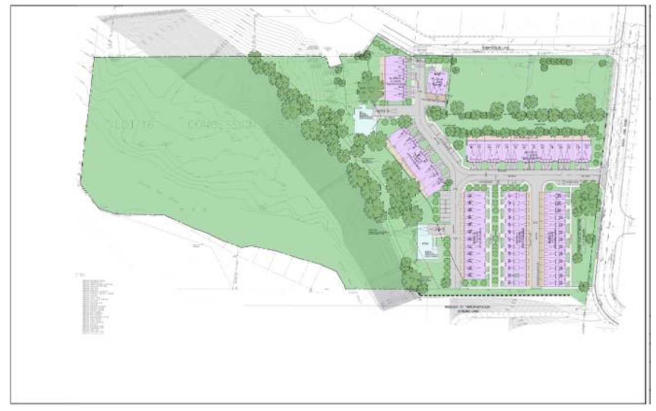
Council meeting November 2017- Revised Development Concept