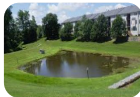
67 Storm Ponds