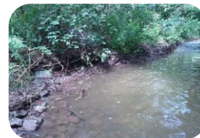
132 creek reaches