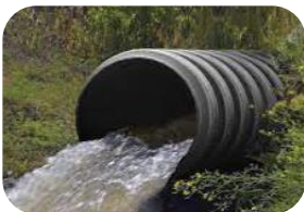
622,700 metres of Storm pipes