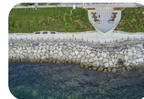
93 shoreline reaches