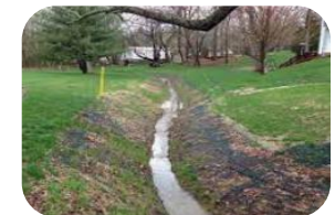
168 km of ditches