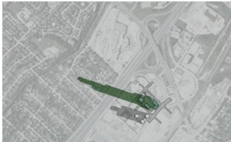
March 21st - 9:18 am