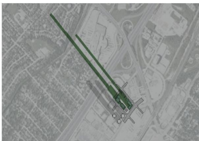
December 21st - 9:18 am