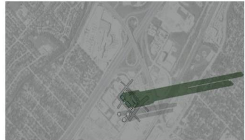
September 21st - 6:18 pm