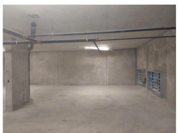
Unit 73 Parking Space