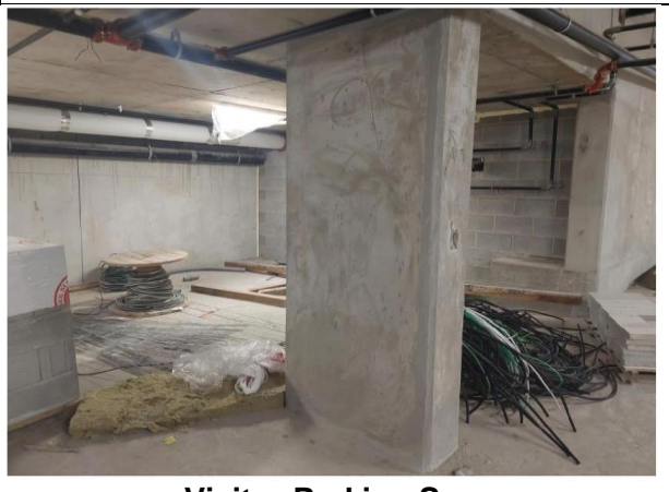
Visitor Parking Space