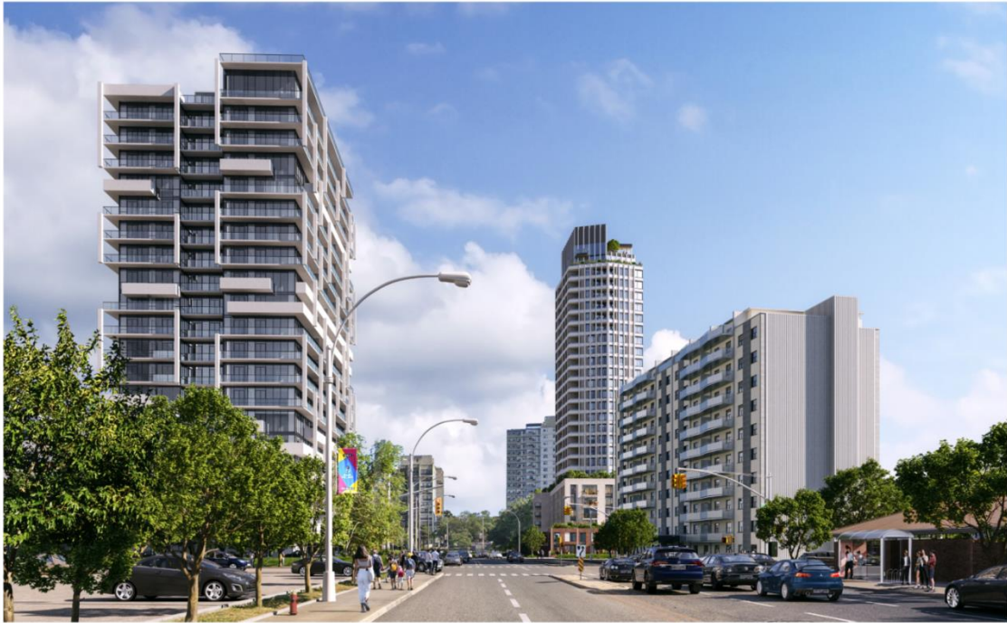
BDP. Quadrangle Project No. 20023 / 3 October 2022 / 50 Speers Road