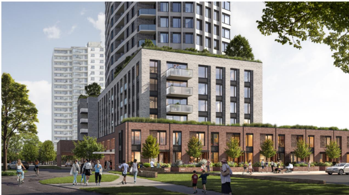
BDP. Quadrangle Project No. 20023 / 3 October 2022 / 50 Speers Road