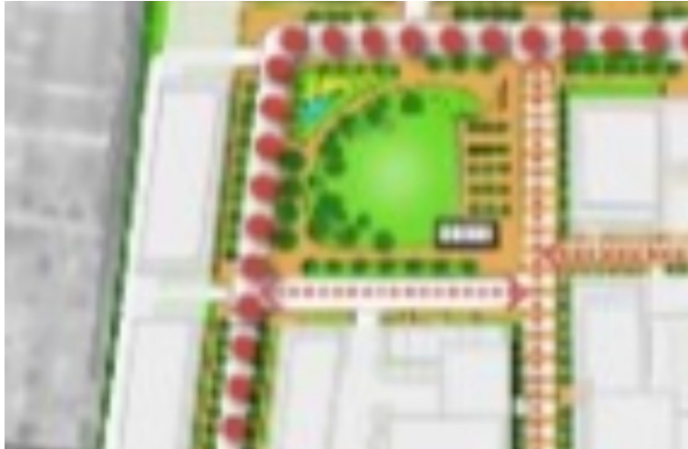
Figure 3 – Urban Strategies proposed park design