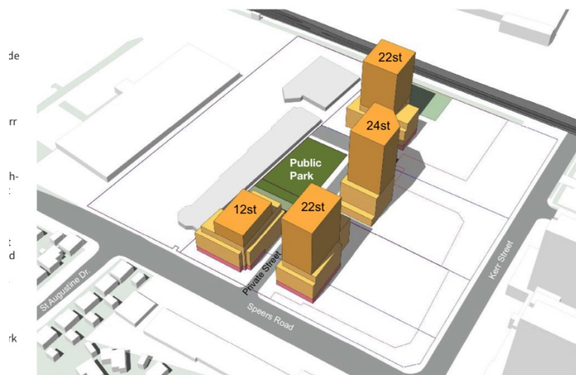
Figure 5 – From Urban Design Brief May 2022