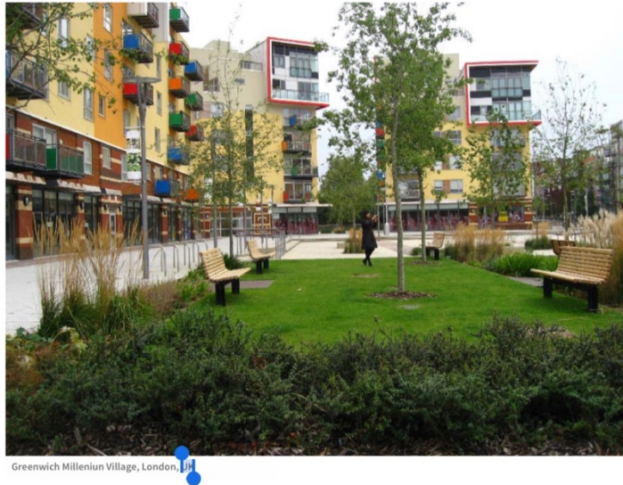
Figure 2 – Greenwich Village Park as an example of planned park development

The one acre park proposed is on top of an underground car park. Figure 3 below shows the proposed design as shown in the Urban Design Brief as submitted by Urban Strategies. This shows that there is infrastructure on the 1 acre that would appear to service the underground parking. At this stage without details it appears to be for ventilation of the area. To the right of the park in Figure 3, there is no greenspace but rather a gravel area that is not serviceable as community park space.