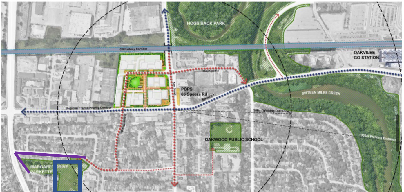
figure 24. Network of open space in the neighborhood context

Figure 4 – Community parks shown by Urban Strategies Design Brief with correction to Margaret Drive Parkette. Blue rectangle is elementary school property and purple line is access to Margaret Parkette.