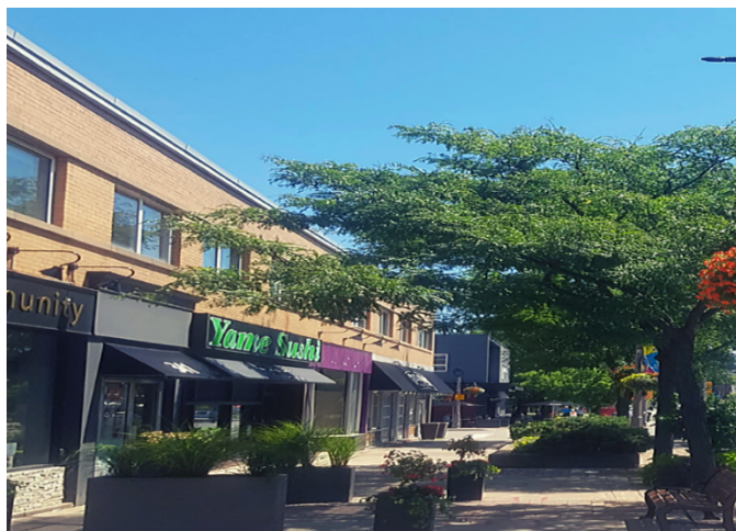
THIS IS OAKVILLE