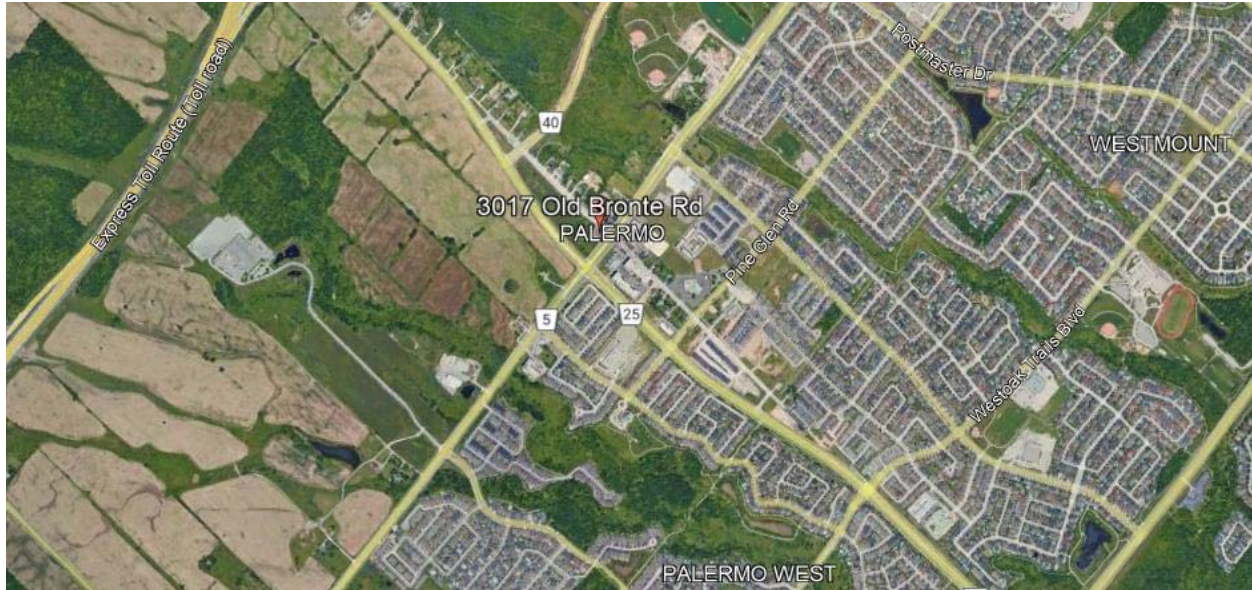
Figure 1: Google Earth Satellite View

The site is located north-east of the corner of Bronte Rd and Dundas Rd on Old Bronte Rd.