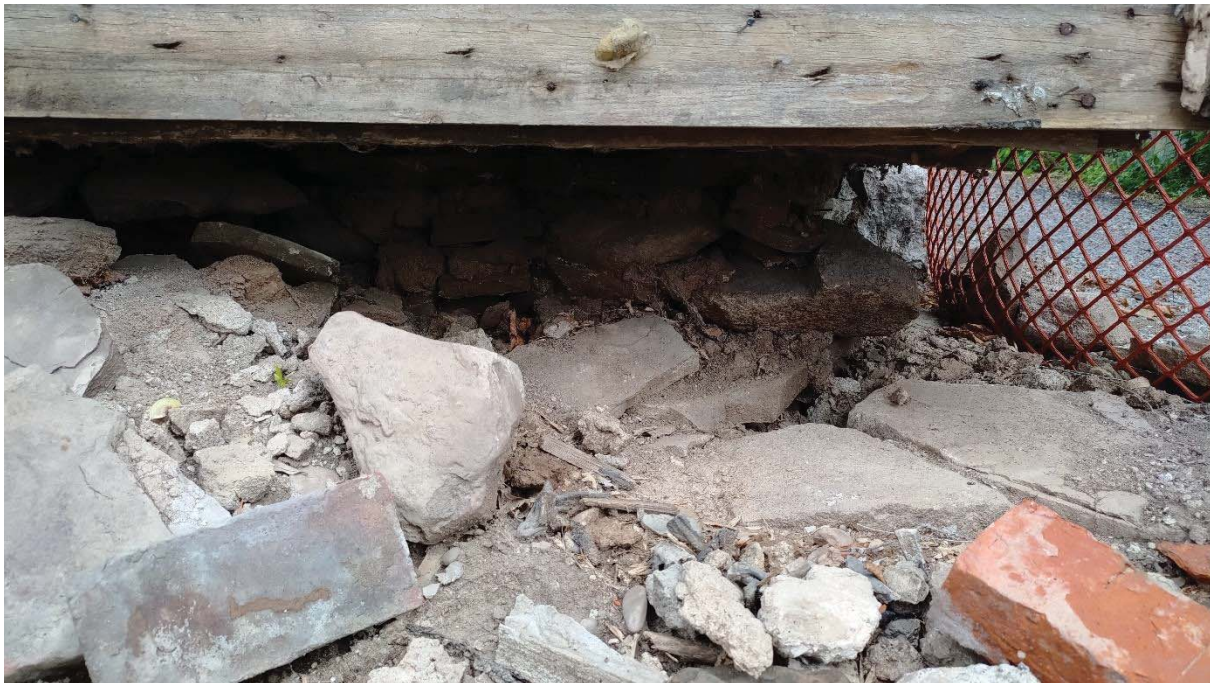
Photo 12: South-West corner at grade under the main floor framing.