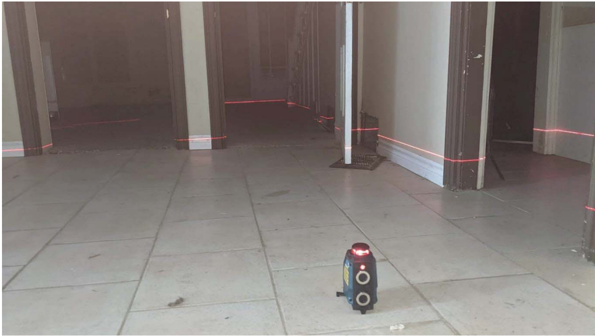
Photo 15: Ground floor showing excessive differential settlements.