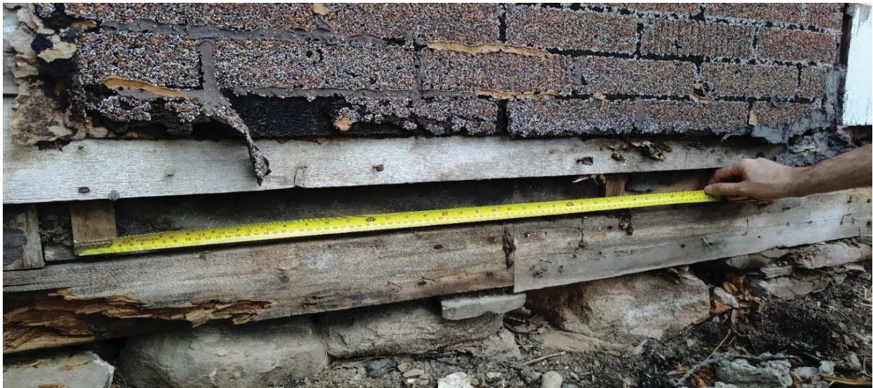
Photo 10: Front side, stud walls are resting on a deteriorated sill plate.