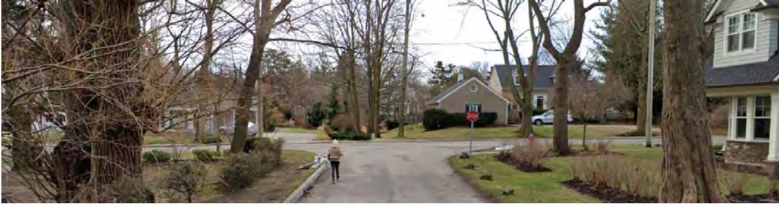
VIEW FROM UNION STREET TOWARDS THE SUBJECT PROPERTY

There is gradual slope between the properties with a slightly lower grade at 52 First Street. There are two large street trees in front of 64 First Street and one in front of 52 First Street and there is a row of smaller but mature trees between the properties.