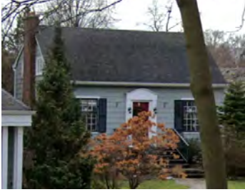
No. 52 dwelling