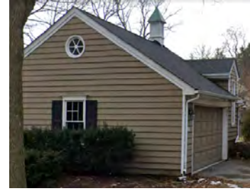
No. 64 garage to be demolished