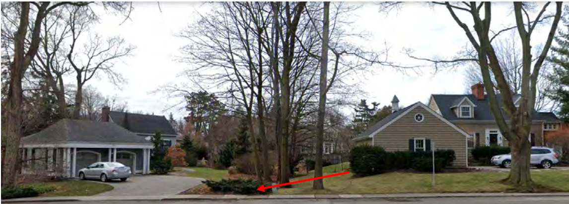
GRADE & VEGETATION – there is a slight change in grade and a row of mature trees between the properties

There is gradual slope between the properties with a slightly lower grade at 52 First Street. There are two large street trees in front of 64 First Street and one in front of 52 First Street and there is a row of smaller but mature trees between the properties.