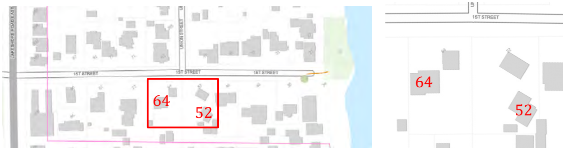
LOCATION MAP: 52 & 64 First Street - each property contains a 1.5 storey dwelling and a detached garage

The subject properties are located at 52 and 64 First Street in the Town of Oakville. They are Designated under Part V of the Ontario Heritage Act and are identified as 'non-contributing' properties within the First and Second Street Heritage Conservation District. The First and Second Street Heritage Conservation District was established in 1991. Alterations and new development within the District are guided by the First and Second Street Heritage Conservation District Plan that was recently updated in 2015.