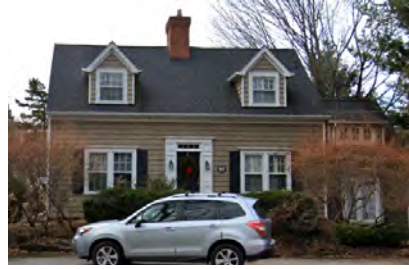
No. 64 dwelling