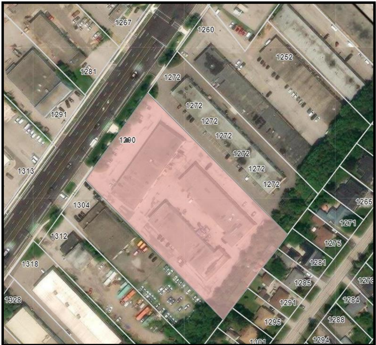
Figure 2 – Air Photo of Subject Lands

The subject lands are located on the south side of Speers Road, between Third Line and Fourth Line. The subject lands have approximately 78.5m in frontage on Speers Road, and are approximately 1.19 hectares in size.