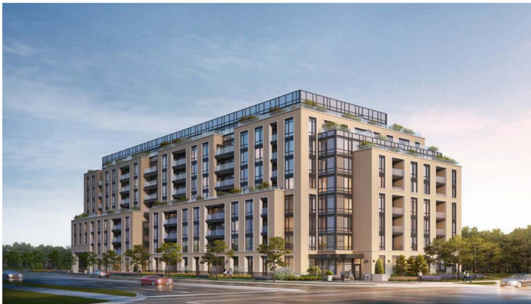
Figure 2 – View from the corner of Trafalgar Road and Glenashton Drive.

The owner has submitted a settlement offer that would allow for the construction of a 9 storey building meeting the 31 m height limit imposed by By-law 2021-021. Since public benefits would be provided for the three of the nine storeys, the proposal would also conform to the policies with respect to height in the Official Plan. A cash payment is proposed by the owner that would have to be applied to eligible projects in the immediate area. This payment could be used towards the development of the park at the corner of Glenashton Drive and Taunton Road. Plans, drawings, shadow studies, a traffic study and a planning justification report were submitted with the offer and are posted on the town website at the link provided above. Excerpts from the drawings and the planning justification report are also attached as appendices to this report.